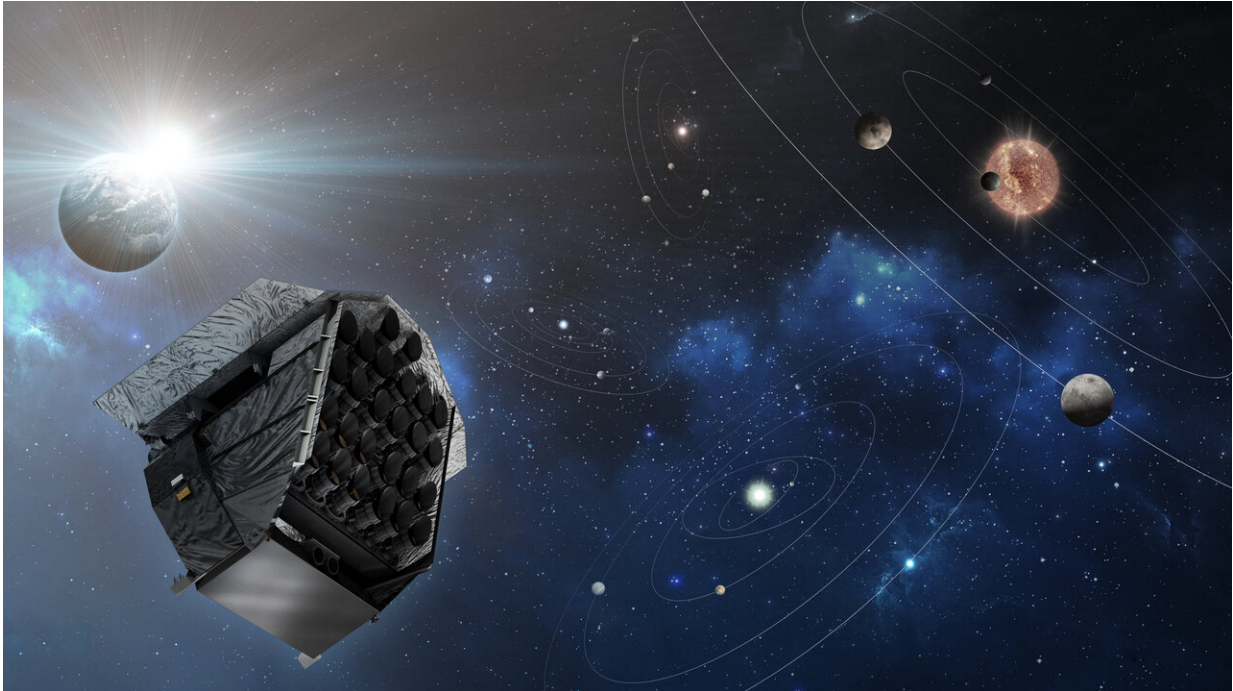
Artist impression PLATO space telescope