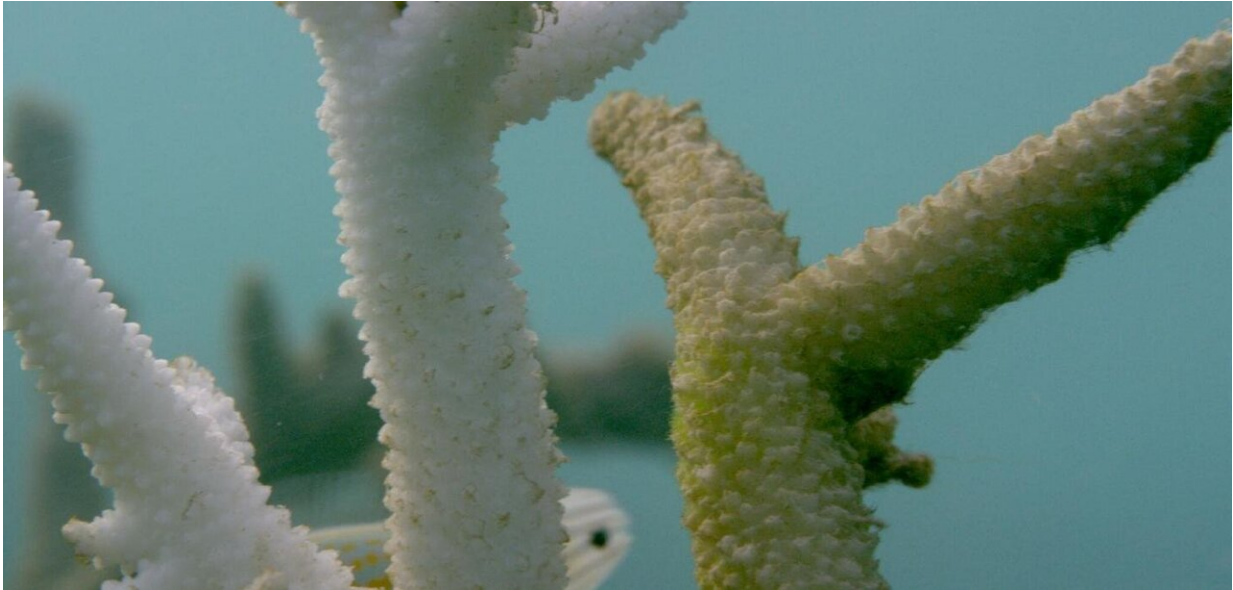
Bleached corals.

To better understand this phenomenon in the new study, Ainsworth and colleagues simulated the severe heatwave conditions seen on the GBR in 2016 with two coral species that showed high mortality that year. Their studies show that marine heatwave events on coral reefs are entirely different from the way coral bleaching has been understood.