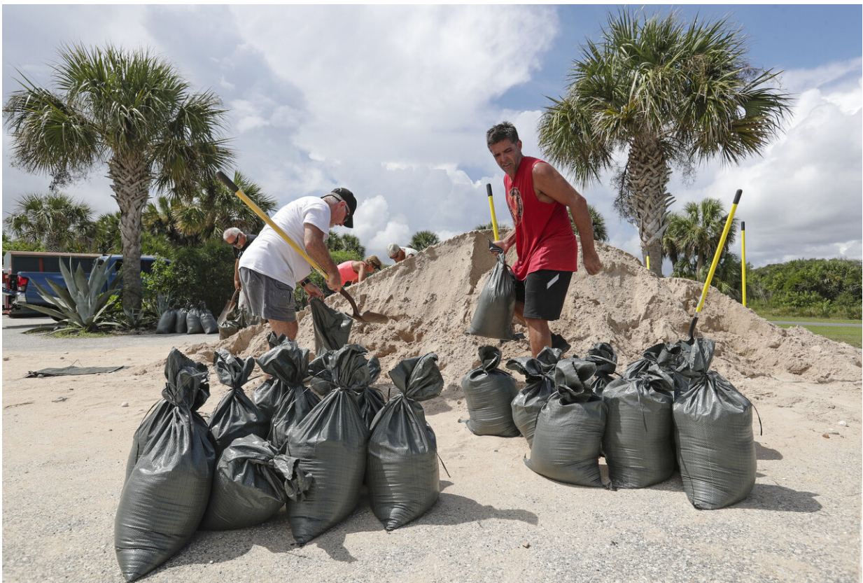
Residents of Flagler Beach, Fla., fill sandbags Friday, Aug. 30, 2019, to help protect their homes in preparation for Hurricane Dorian Friday, Aug. 30, 2019.

"It felt like it was better to be safe than sorry, so we canceled our plans," she said.