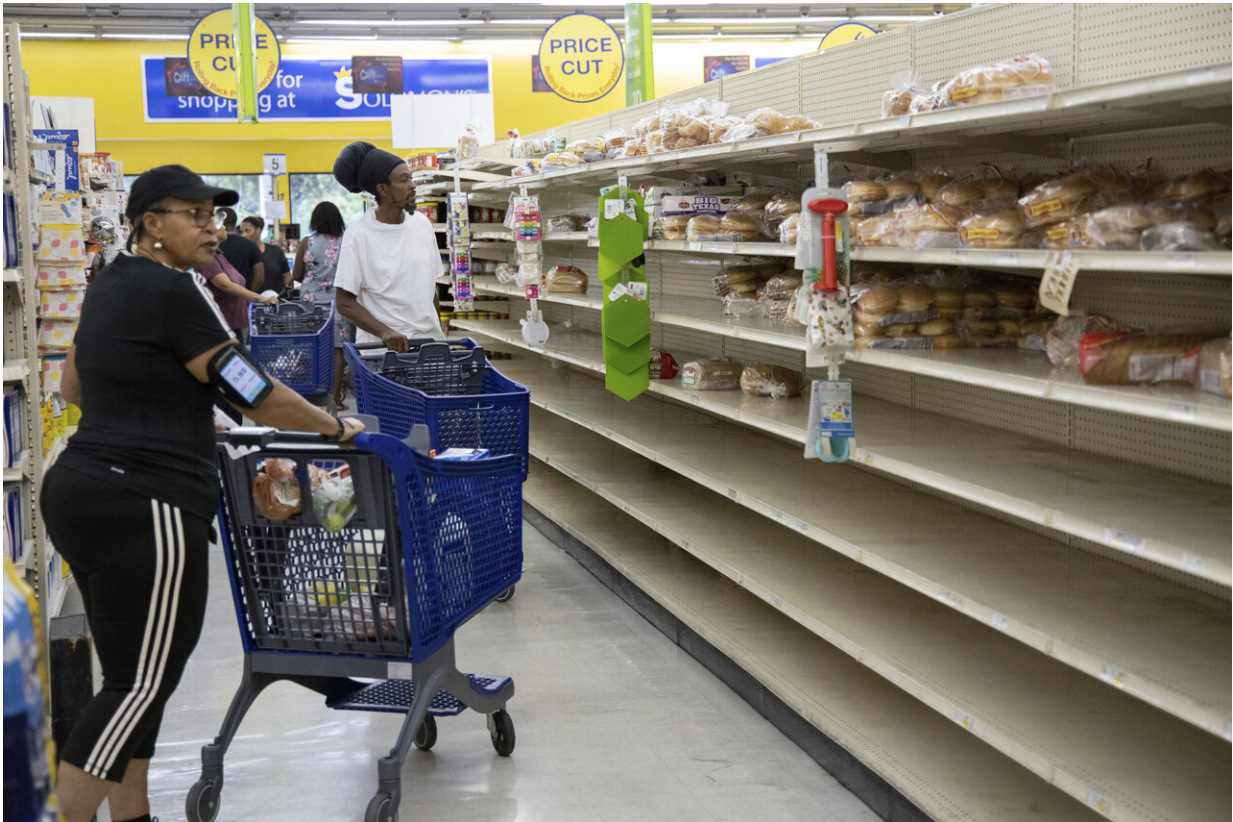
People shop for supplies before the arrival of Hurricane Dorian, in Freeport, Bahamas, Friday, Aug. 30, 2019. Forecasters say the hurricane is expected to keep on strengthening and become a Category 3 later in the day.