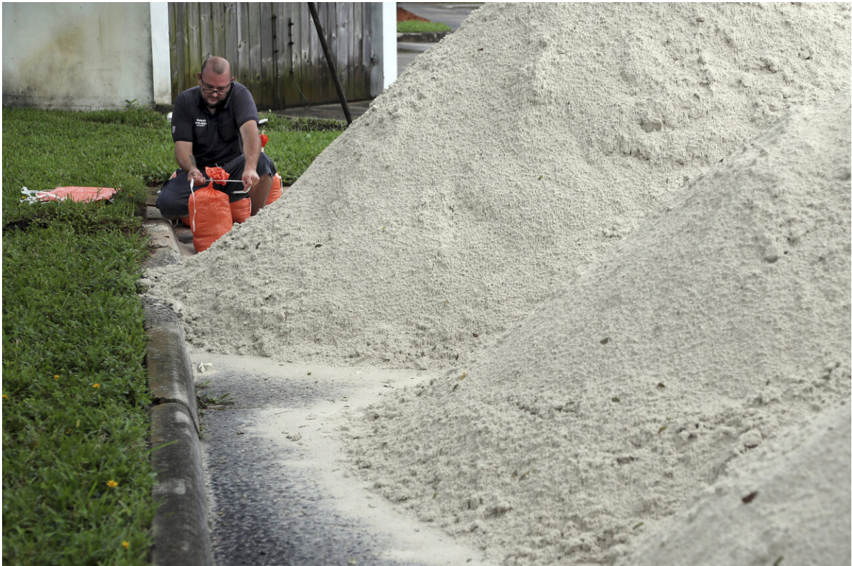
A resident fills bags during a sandbag giveaway in preparation for Hurricane Dorian, Friday, Aug. 30, 2019, in Margate, Fla.

At a Publix supermarket in Cocoa Beach, Ed Ciecirski of the customer service department said the pharmacy was extra busy with people rushing to fill prescriptions. The grocery was rationing bottled water and had run out of dry ice.