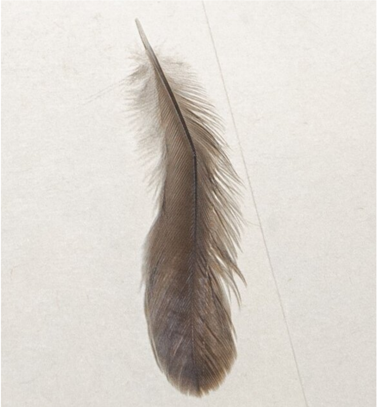
The feather of a Galapagos finch.

While scientists today know more about how new species are formed, the principles Darwin developed remain the foundation of evolutionary