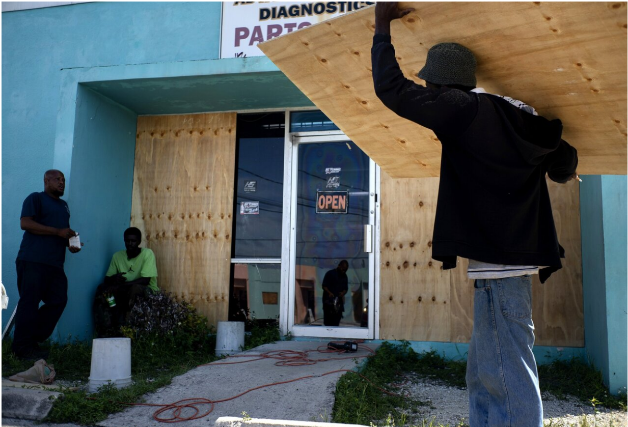
Workers board up a shop's window front as they make preparations for the arrival of Hurricane Dorian, in Freeport, Bahamas, Friday, Aug. 30, 2019. Forecasters said the hurricane is expected to keep on strengthening and become a Category 3 later in the day.