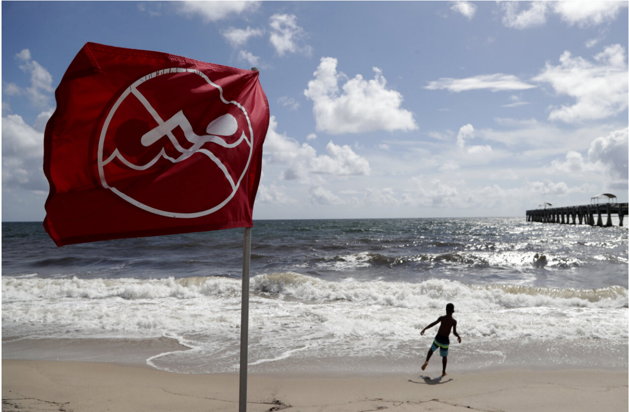
A boy plays on the beach as a No Swimming flag flies, Saturday, Aug. 31, 2019, in Lake Worth, Fla. Hurricane Dorian is bearing down on the northwestern Bahamas as a Category 4 storm. Forecasters say Dorian is then expected to go up the Southeast coastline.