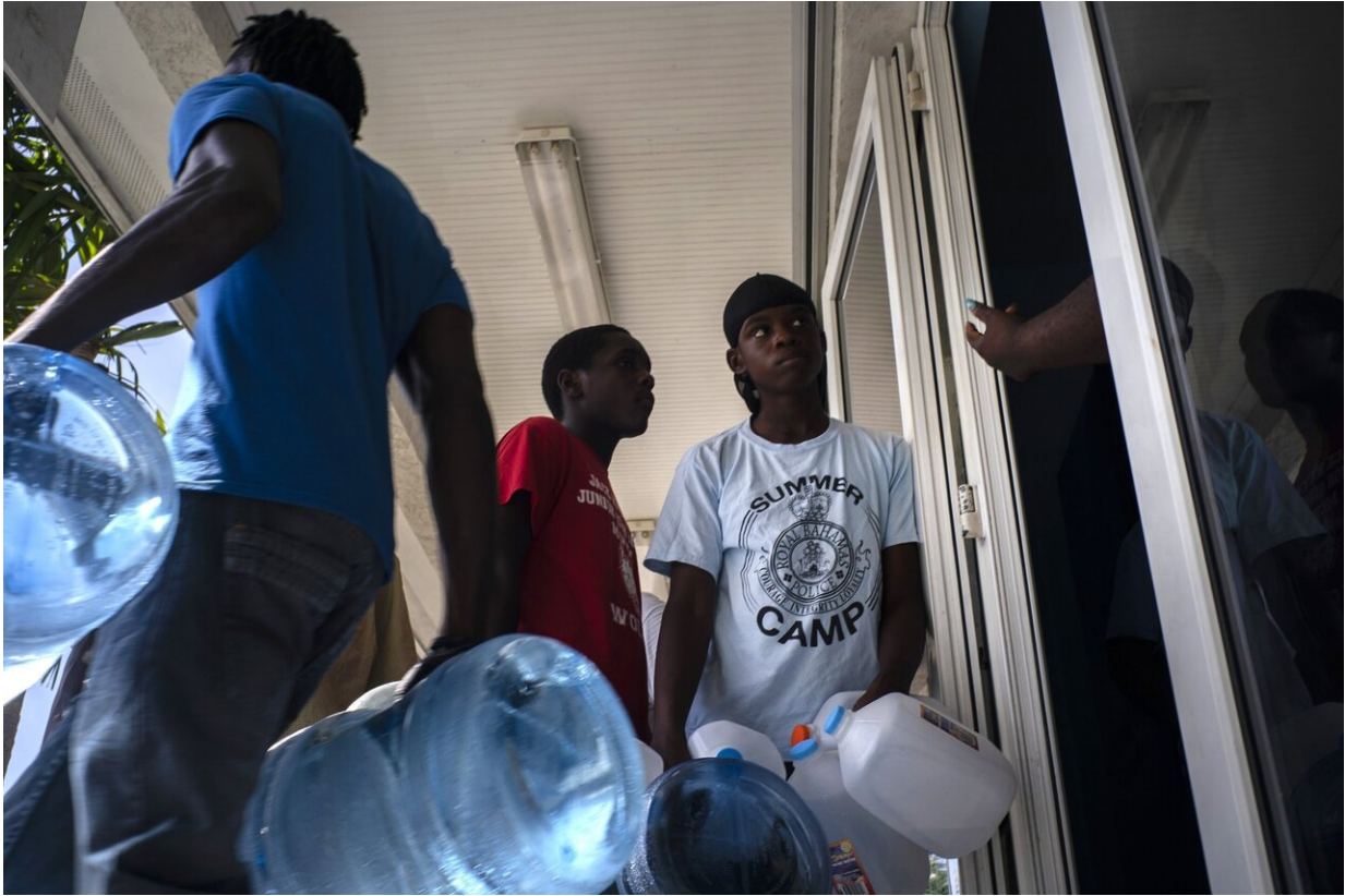
People line up to buy water at a store before the arrival of Hurricane Dorian, in Freeport, Bahamas, Friday, Aug. 30, 2019. Forecasters said the hurricane is expected to keep on strengthening and become a Category 3 later in the day.