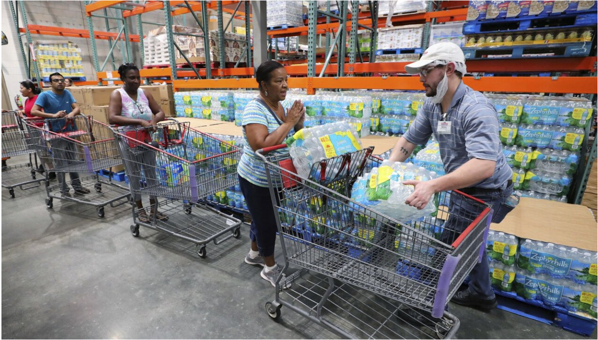
A shopper is grateful to get two cases of bottled water —the limit per customer—at a Costco store in Altamonte Springs, Fla., Friday, Aug. 30, 2019, as central Florida residents prepare for a possible strike by Hurricane Dorian.