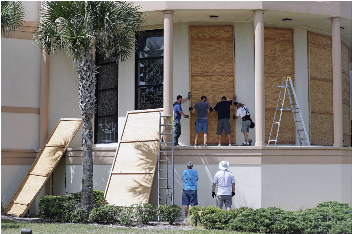
Workers cover stained glass windows with plywood sections at the Santa Maria del Mar Catholic Church in preparation for Hurricane Dorian, Friday, Aug. 30, 2019, in Flagler Beach, Fla.