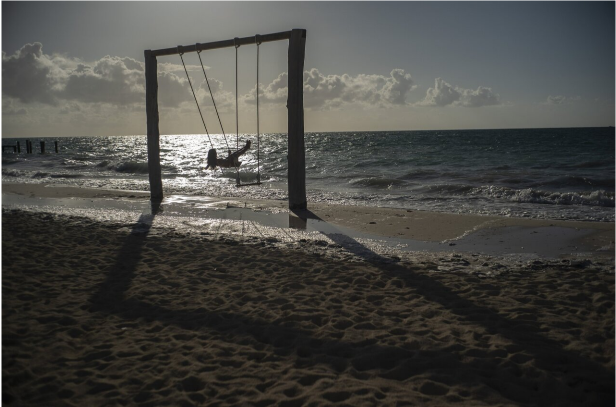
Tourist Loren Fantasia from Baltimore, swings on the beach before the arrival of Hurricane Dorian, in Freeport, Bahamas, Friday, Aug. 30, 2019. Forecasters said the hurricane is expected to keep on strengthening and become a Category 3 later in the day.