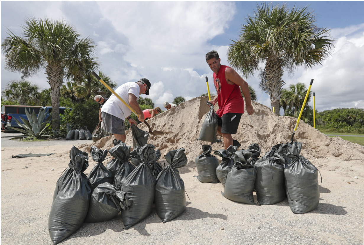
Residents of Flagler Beach, Fla., fill sandbags Friday, Aug. 30, 2019, to help protect their homes in preparation for Hurricane Dorian Friday, Aug. 30, 2019.