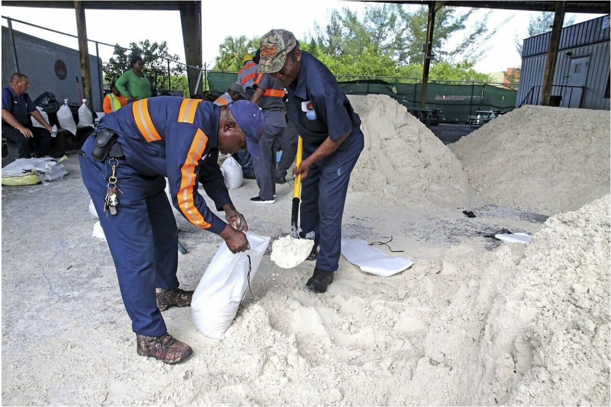
Opa Locka, Fla. city workers fill sandbags Friday, Aug. 30, 2019. Hurricane Dorian was muscling a chaotic path toward Florida, with officials and residents bracing for the possibility it would unleash its full fury early next week but clinging to the glimmer of hope that the strengthening storm could simply skirt the coastline.