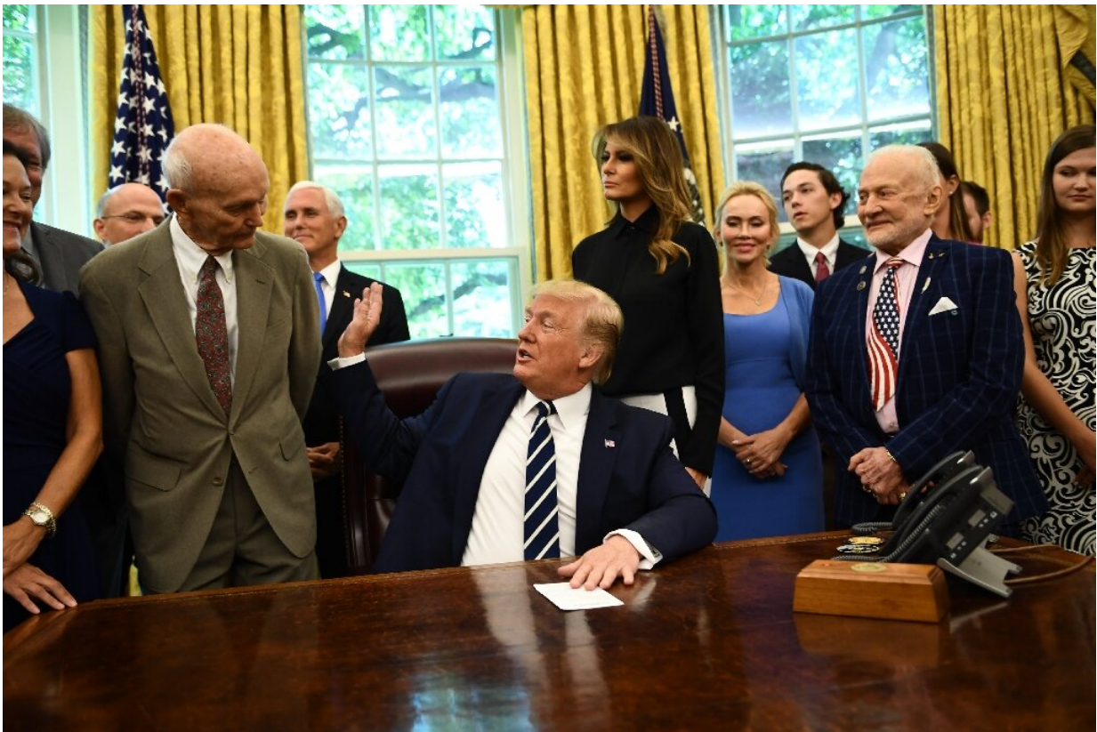
US President Donald Trump and First Lady Melania Trump host Apollo 11 crew members Michael Collins (L), Buzz Aldrin (R) and their families at the White House

As magnificent as that view was, it was "nothing compared to this other window out there," Collins continued.