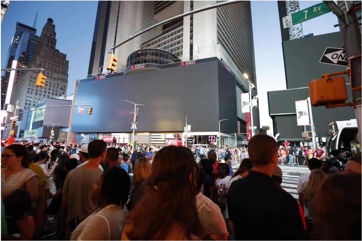
Screens in Times Square are black during a widespread power outage, Saturday, July 13, 2019, in the Manhattan borough of New York. Authorities say a transformer fire caused a power outage in Manhattan and left businesses without electricity, elevators stuck and subway cars stalled.