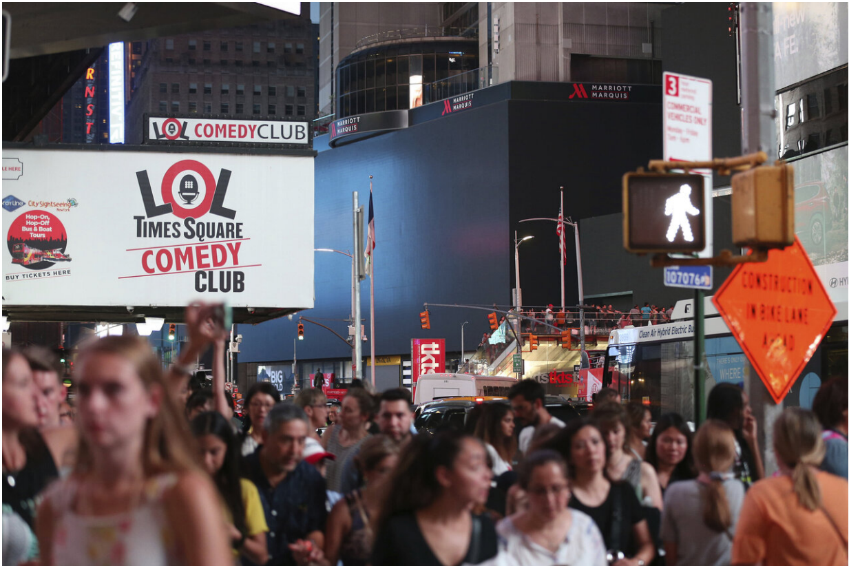
Screens in Times Square are black during a widespread power outage, Saturday, July 13, 2019, in the Manhattan borough of New York. Authorities say a transformer fire caused a power outage in Manhattan and left businesses without electricity, elevators stuck and subway cars stalled.