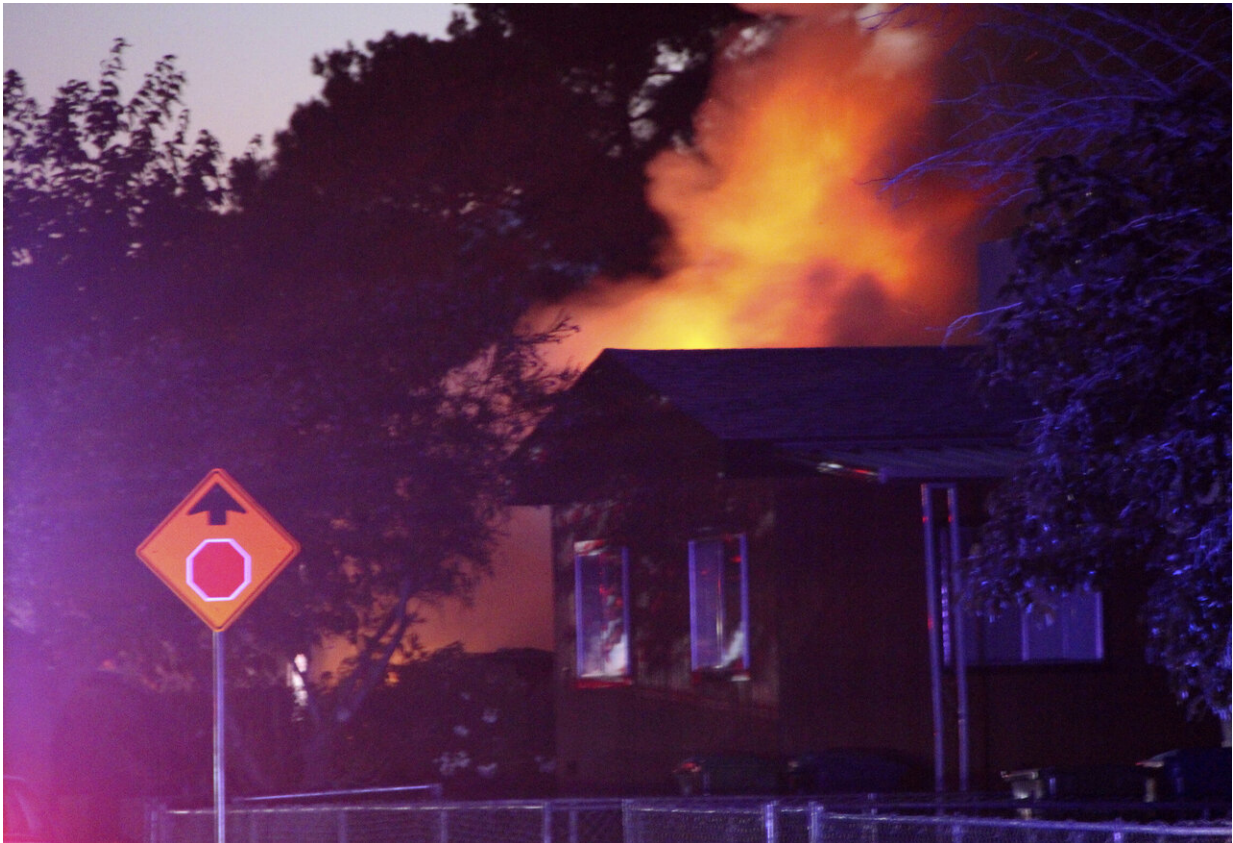
A fire burns behind the Casa Corona restaurant following an earthquake in Ridgecrest, Calif., Friday, July 5, 2019.