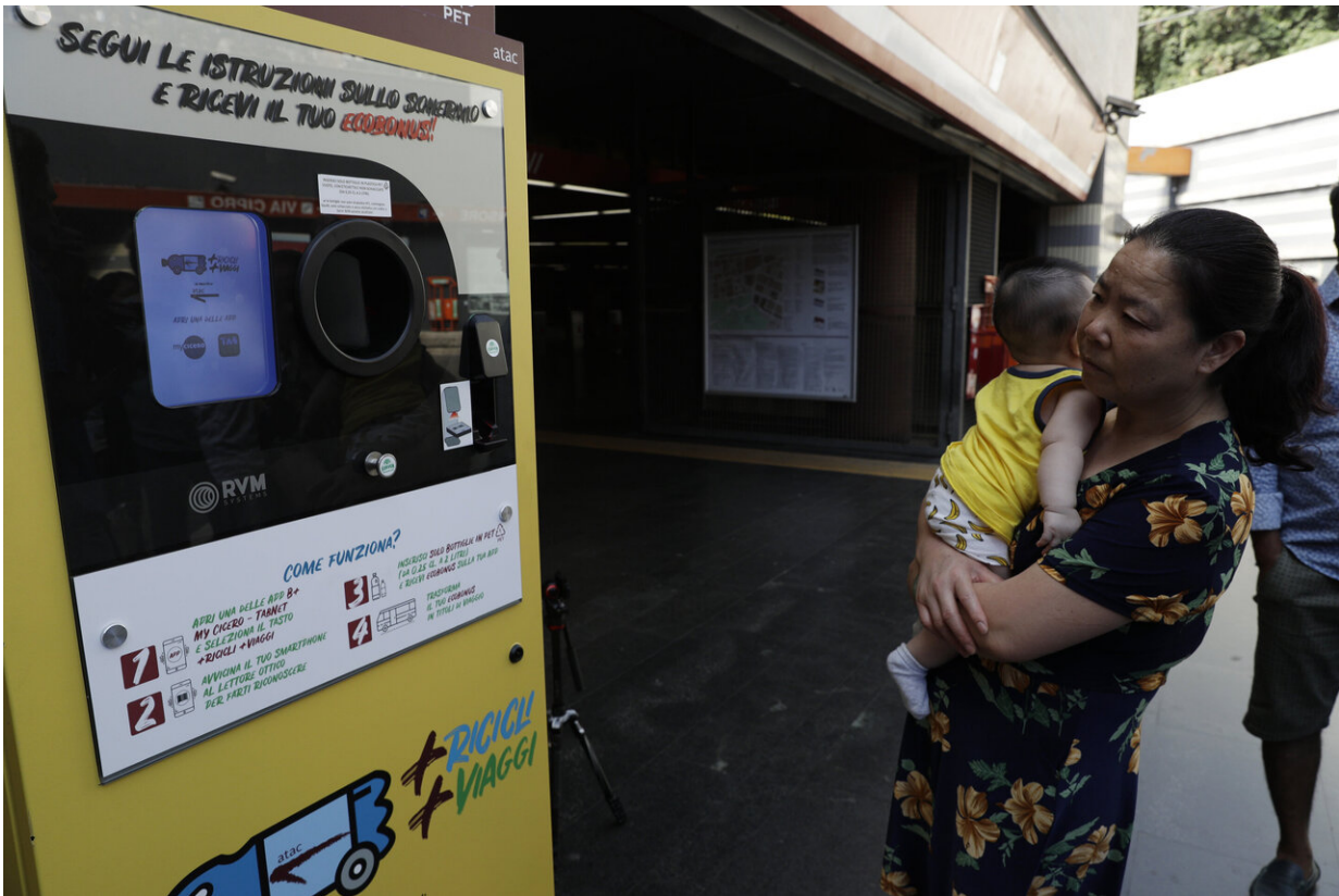
A woman looks at an automatic recycling bin outside a metro station in Rome, Wednesday, July 24, 2019. Rome unveiled Tuesday three test machines around metro stations where passengers can drop plastic water bottles, receiving five cents apiece, which goes to the passenger's account in partner apps to be redeemed for public transportation tickets.