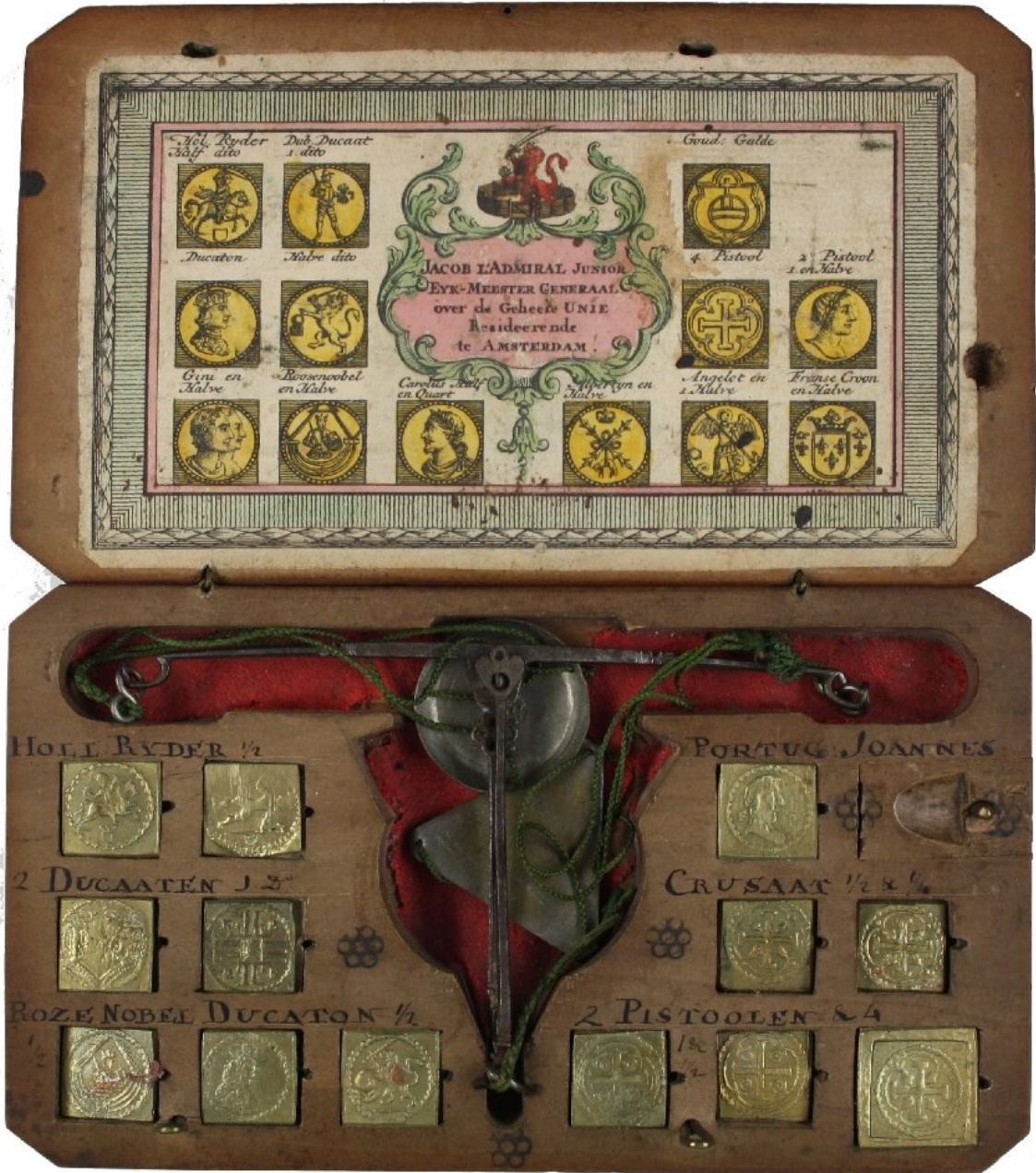
This set of hand scales from 1749 weighed and tested coins

There is also a rotating Cold War radiation fallout calculator, from