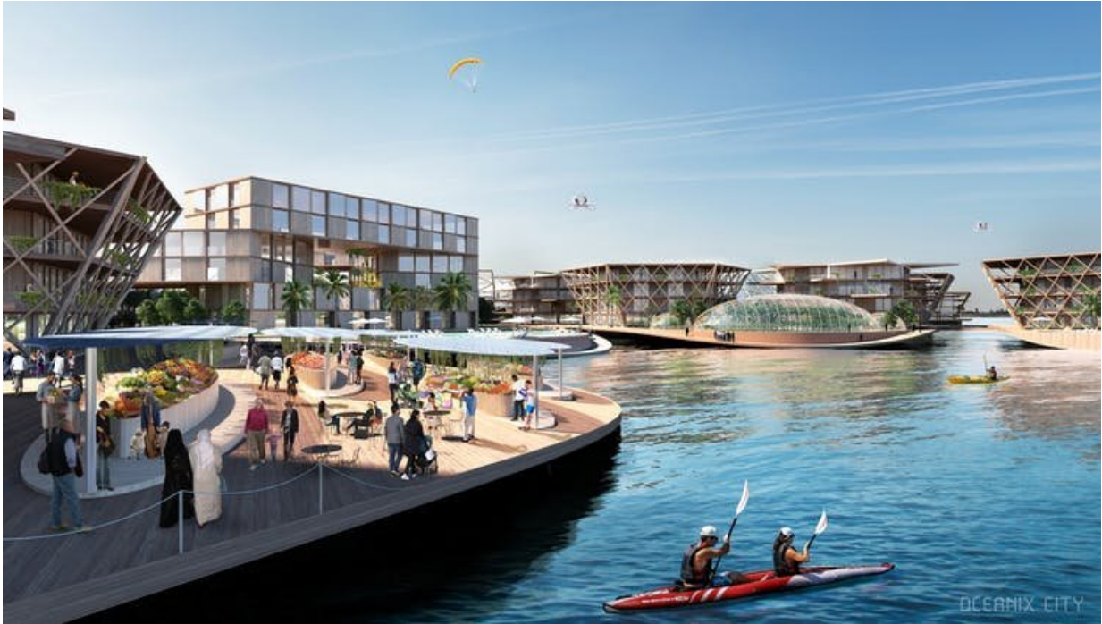
Life on a floating city, Oceanix. Credit: OCEANIX/BIG-Bjarke Ingels Group

The Japanese Metabolists put forward incredible projects such as Kenzo Tange's 1960 Tokyo Bay Plan and the marine city proposals of Kikutake and Kurokawa.