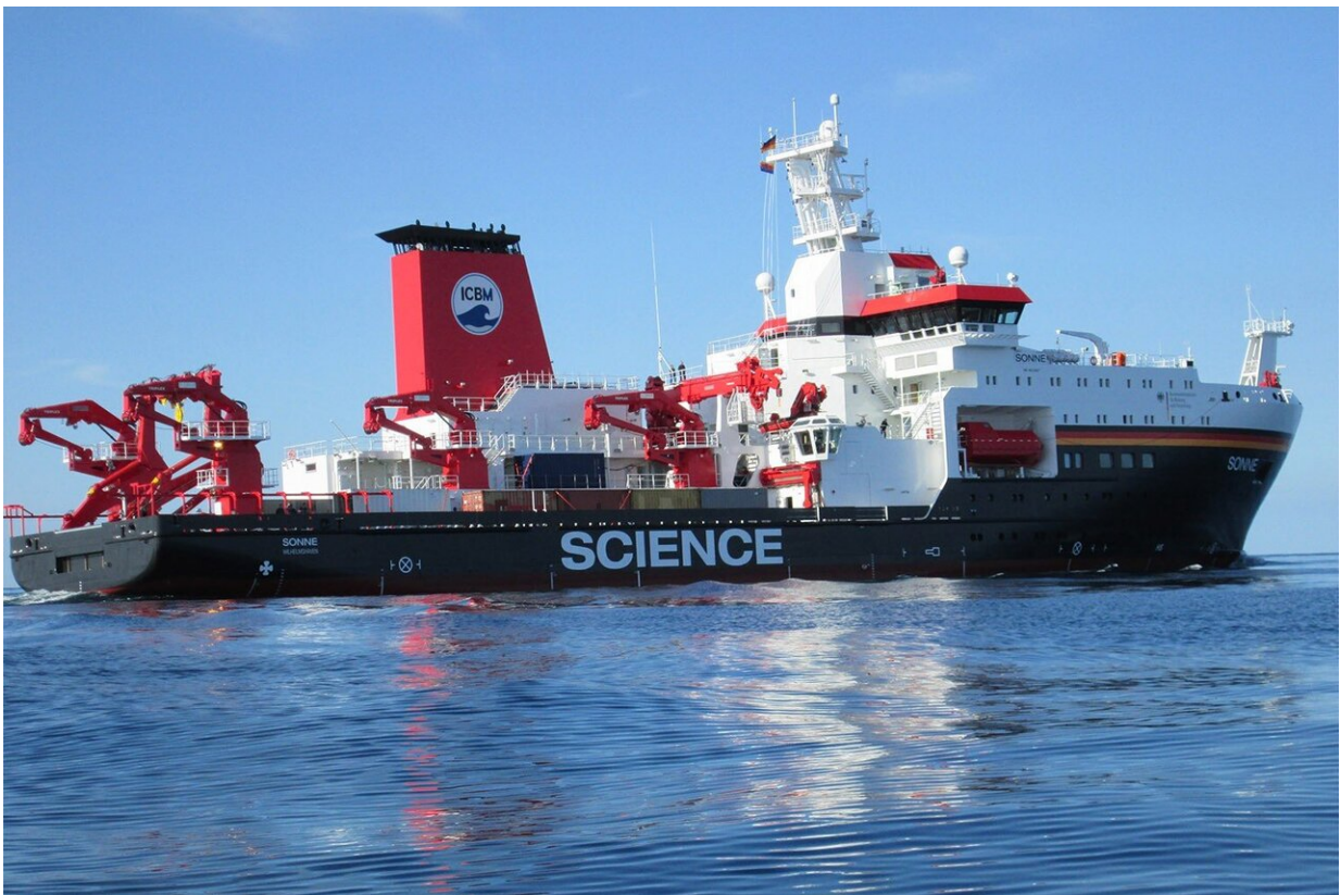
Research Vessel Sonne.

most of the material is deposited on the seabed. "The measurements will allow us to estimate whether it is true that only around one hundredth of the total amount of plastic can be found at the water surface," the environmental chemist says. The sediment samples and the water will also be examined for organic pollutants to find out if plastic is a source or sink of pollutants into the marine environment.