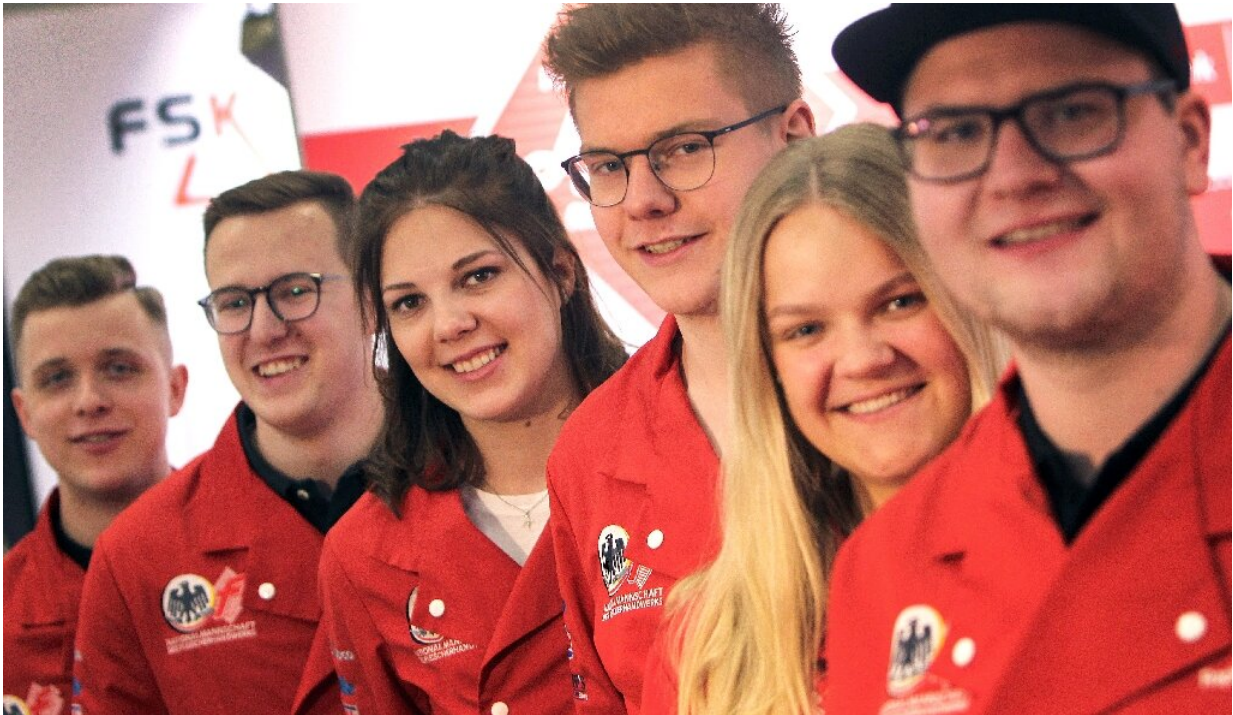
Members of the German national team of butchers