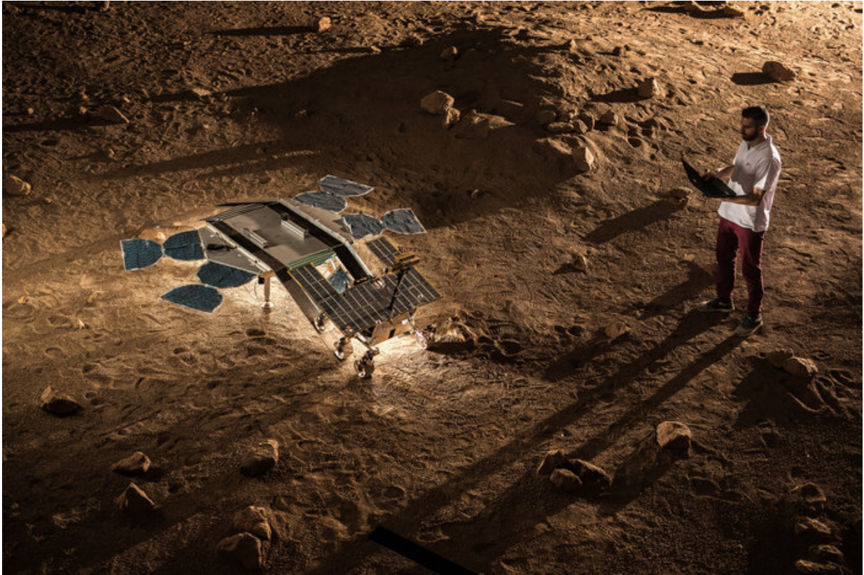
Moving off the landing platform.

The enormous distance from Earth to Mars means that a signal can take between 4 and 24 minutes to reach the control center, making direct control of ExoMars impractical. Rosalind Franklin will be able to take some of its own decisions.