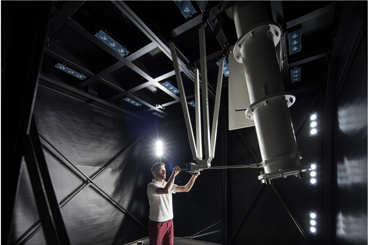
Drill platform for ExoMars rover.