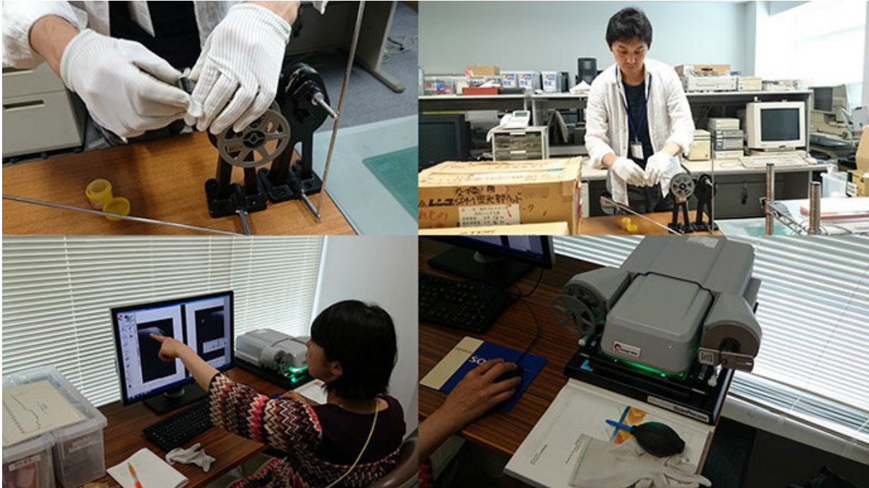
Microfilm readout work.