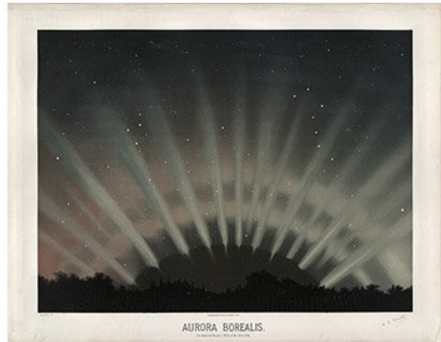
Left: A drawing depicting the Aurora seen from Kyoto in September 1770. Credit: Matsusaka City, Mie Prefecture. Right: A painting of Truvero with an explanation of 9:25 on March 1, 1872. Credit: Research Organization of Information and Systems

Physics researchers and literature researchers have joined together to better understand the rare natural phenomenon of white and red auroras fanning across the night sky in Japan. Armed with drawings and descriptions dating back to the 1700s, microfilm from the 1950s, and today's spectral image data, they've confirmed the accuracy of the older depictions. They've also started to understand how the fan-shaped auroras appear, both in the sky and to the eye.