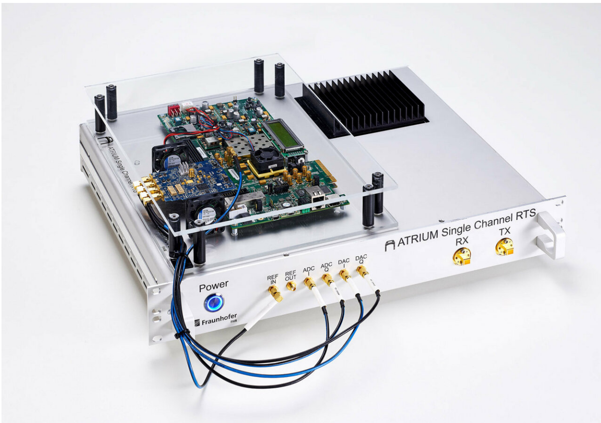
Single-channel version of the ATRIUM radar target simulator.

To simplify this situation, attempts are being made to simulate reality and bring the road tests into the laboratory. This type of laboratory test already exists for radar sensors . Radar sensors emit a radio signal that is reflected by various objects. Based on the echo, electronic sensor systems can then analyze the surroundings, measuring the distance to detected objects and the speed at which they are moving.