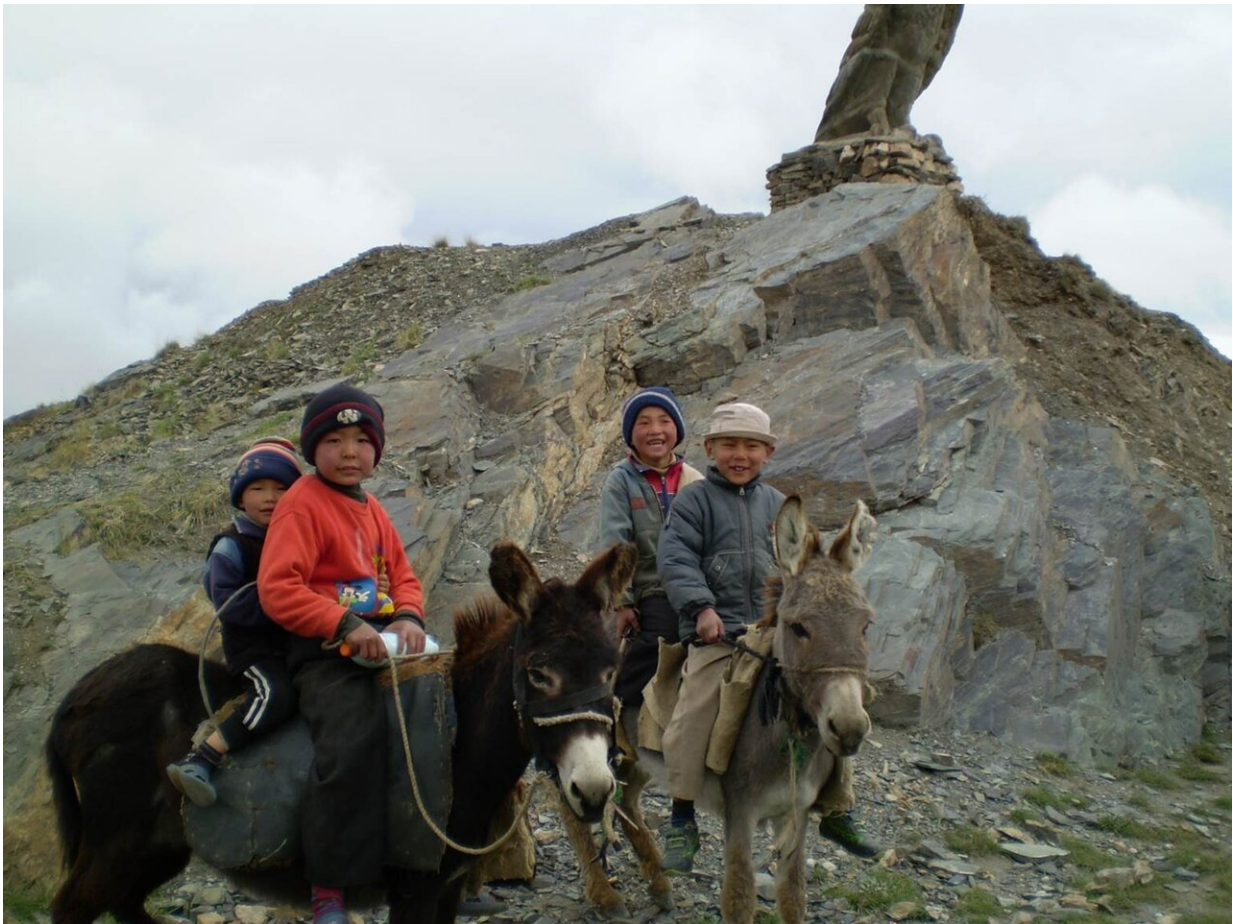
Children from one of the Tajikistan communities included in the study.