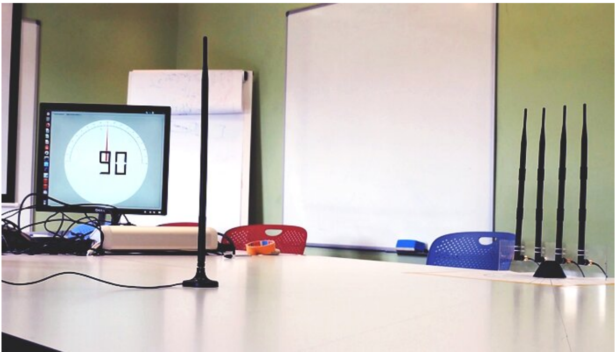
Fig. 1. Angle of arrival (AoA) estimation at Low Frequency (2.45GHz). The setup includes an antenna array of 4 elements. We use the algorithm MUSIC in order to estimate the AoA of the signal received.

Future high-speed communication networks based on millimeter-wave