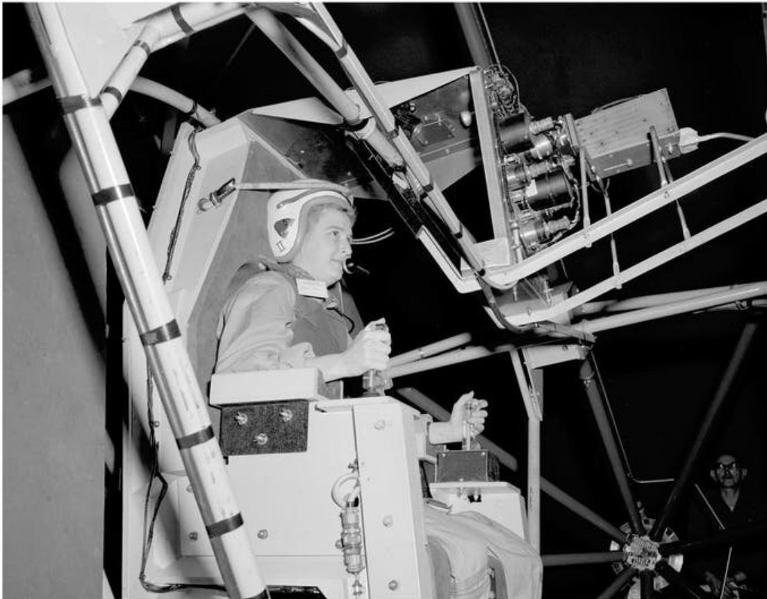
National Aeronautics and Space Administration Lewis Research Center