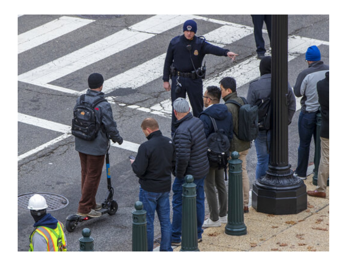
In this Dec. 5, 2018, photo a police officer directs a rider on a Skip brand electric scooter to move off the street on Capitol Hill in Washington. Scooter companies are facing challenges from every direction including vandalism, theft, rider injuries, intense competition and aggressive regulations in cities across the U.S.

In this Dec. 4, 2018, photo a man rides a scooter near the White House in Washington. Electric scooters are overtaking station-based bicycles as the most popular form of shared transportation outside transit and cars. (AP Photo/Andrew Harnik)