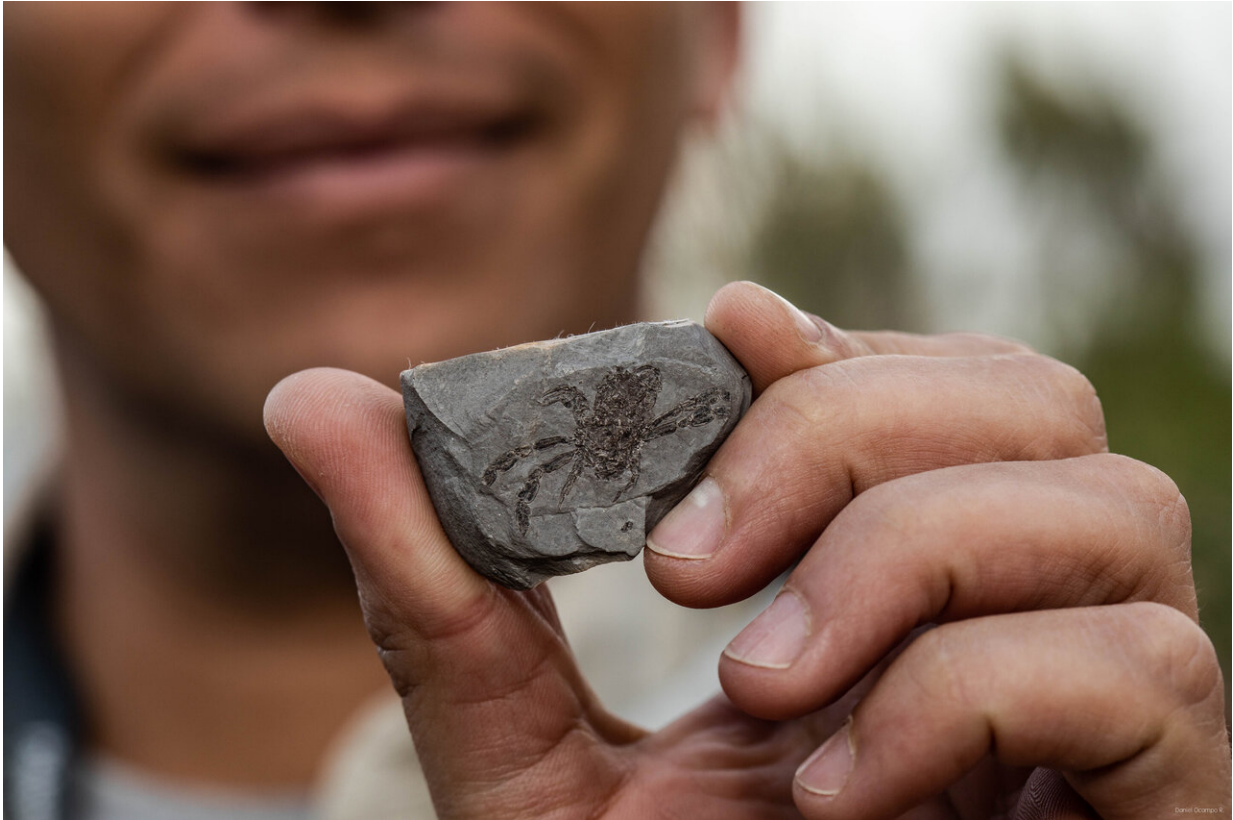
Callichimaera perplexa : The oldest swimming crab from the dinosaur era.