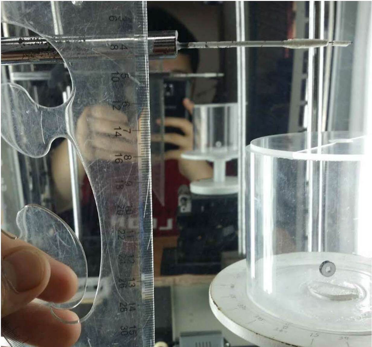
Torsion pendulum made of spider dragline silk.

"The protein has a rotational symmetry built in," Buehler says. And through its torsional force, it makes possible "a whole new class of materials." Now that this property has been found, he suggests, maybe it can be replicated in a synthetic material. "Maybe we can make a new