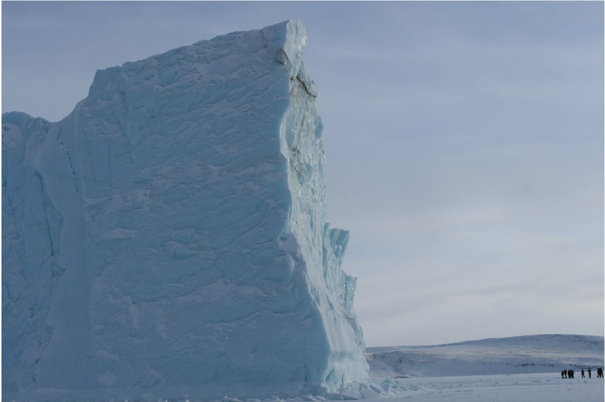
A large iceberg near Thule Air Base, Greenland.

The GLISTIN-A radar maps the edges of glaciers along the entire coastline of the island and measures their heights precisely. As a glacier loses ice and speeds up, it stretches out and gets thinner, so that its surface is lower than before. The height measurement enables researchers to estimate how much ice has been lost since the preceding year's measurement.