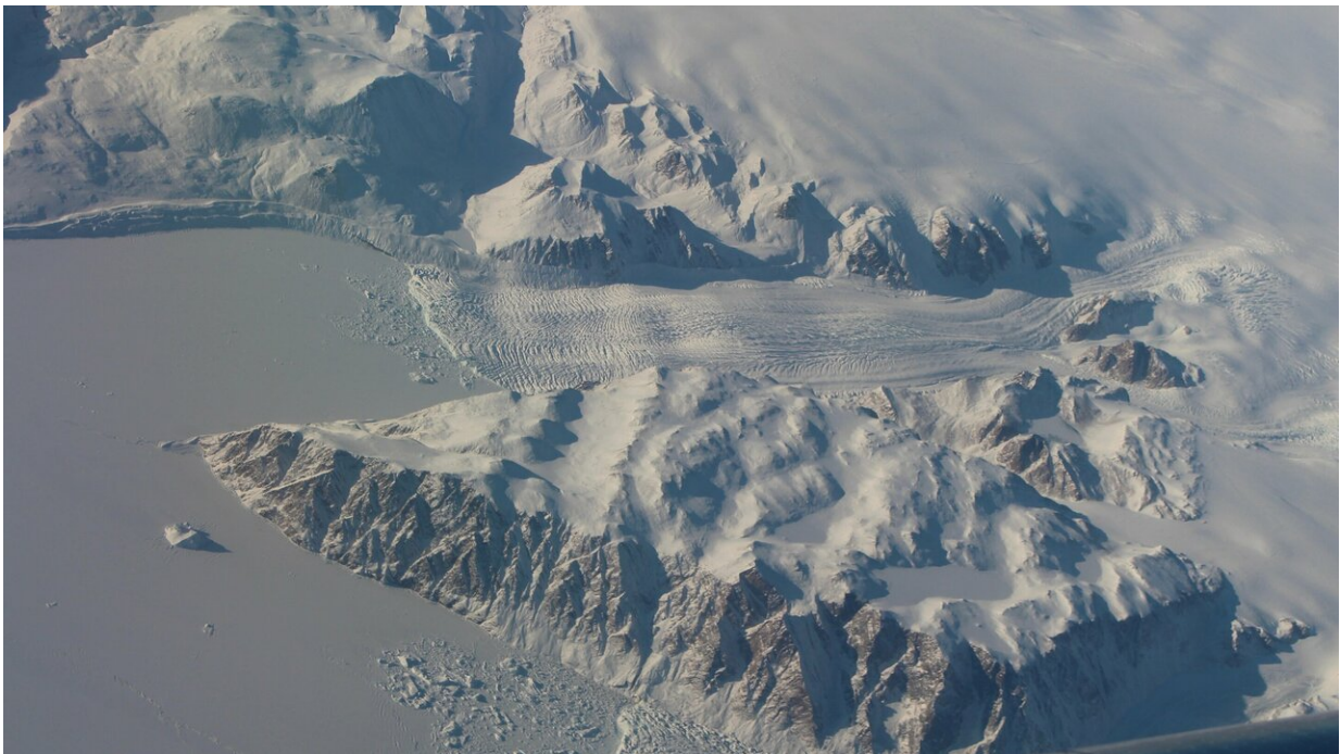
A Greenland glacier.

The G-III aircraft and its crew are based at NASA's Johnson Space Center in Houston. This spring campaign is using two bases: Keflavik, Iceland, and the U.S. Air Force's Thule Air Base in Greenland. Flights began last week from Keflavik to map glaciers in southern and eastern Greenland. The crew will soon transit to Thule to survey western and northern Greenland. The campaign will continue until all measurements have been completed—around March 20, depending on weather.