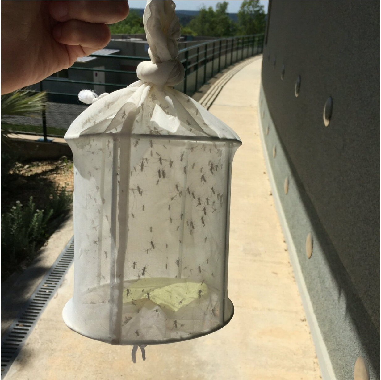
Trap of Culex pipiens mosquitoes from France, provided by EID (Entente Interdépartementale Démoustication) in Montpellier, France.

" Wolbachia is particularly difficult to study because, unlike free-living bacteria, it cannot be cultured in cell-free media. Through this