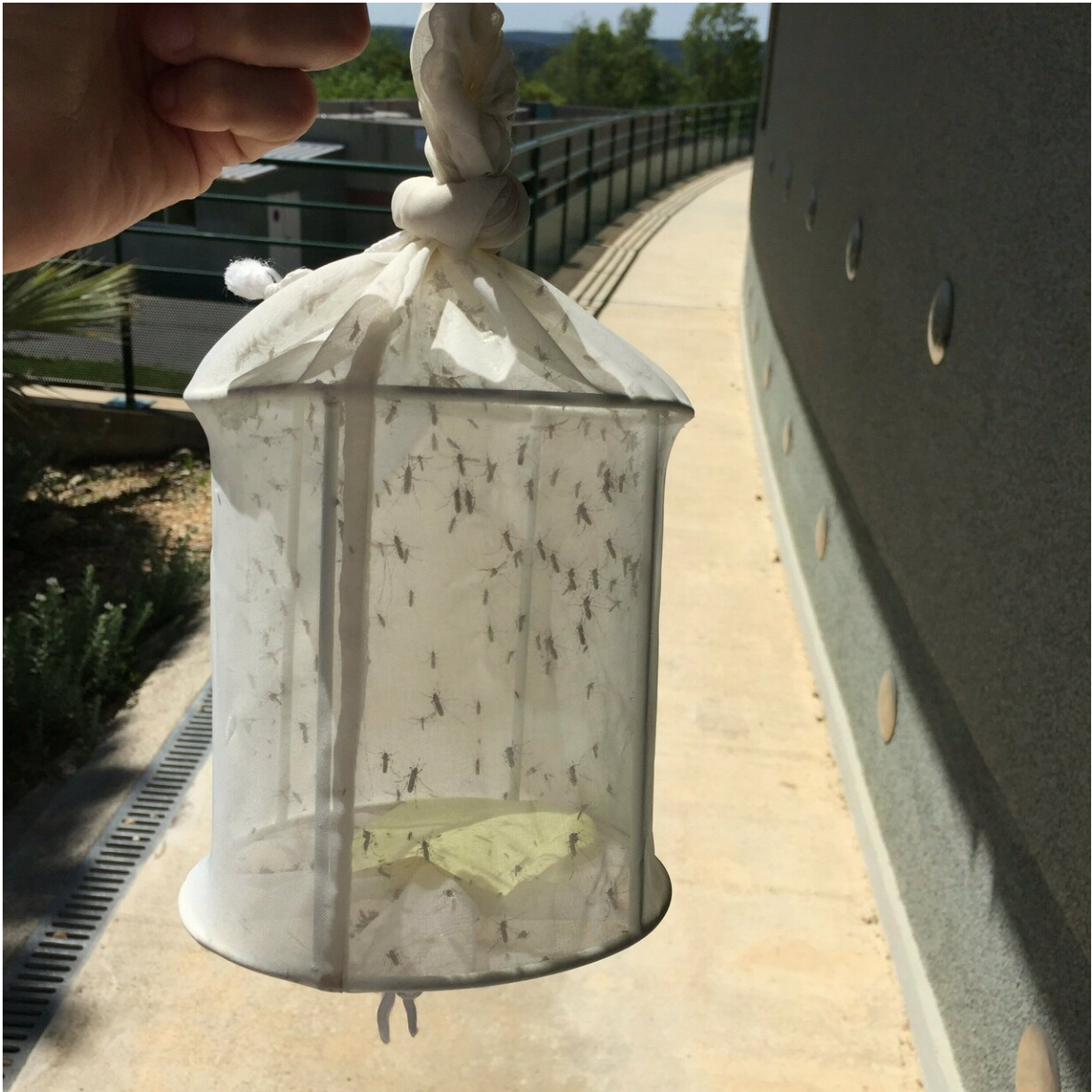
Trap of Culex pipiens mosquitoes from France, provided by EID (Entente Interdépartementale Démoustication) in Montpellier, France.

" Wolbachia is particularly difficult to study because, unlike free-living bacteria, it cannot be cultured in cell-free media. Through this