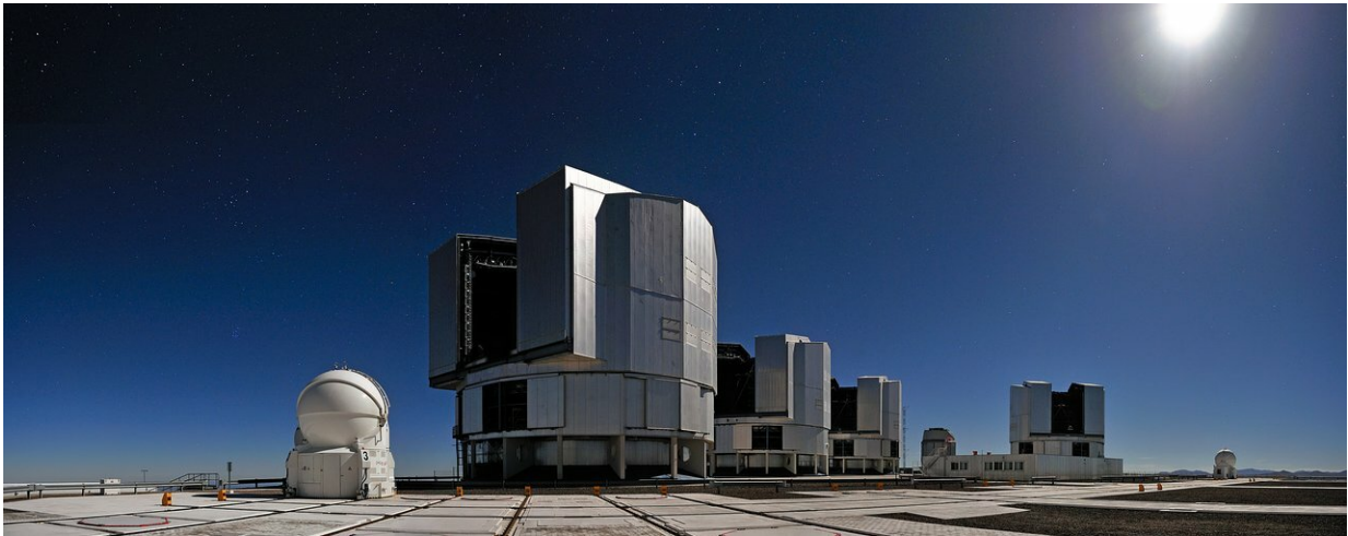
All four VLT Unit Telescopes working as one.

PDS 27 is at least 10 times more massive than our Sun, Dr Koumpia explained, and about 8,000 light years away. To determine the presence of stellar companions for PDS 27 and PDS 37, the team used the highest spatial resolution provided by the PIONIER instrument on the European Southern Observatory's Very Large Telescope Interferometer (VLTI). This instrument combines light beams from four telescopes, each of which is 8.2 metres across, and mimics a single telescope with a diameter of 130m. The resulting high spatial resolving power allowed the team to resolve such close binary systems despite their huge distance from us and their close proximity to each other.