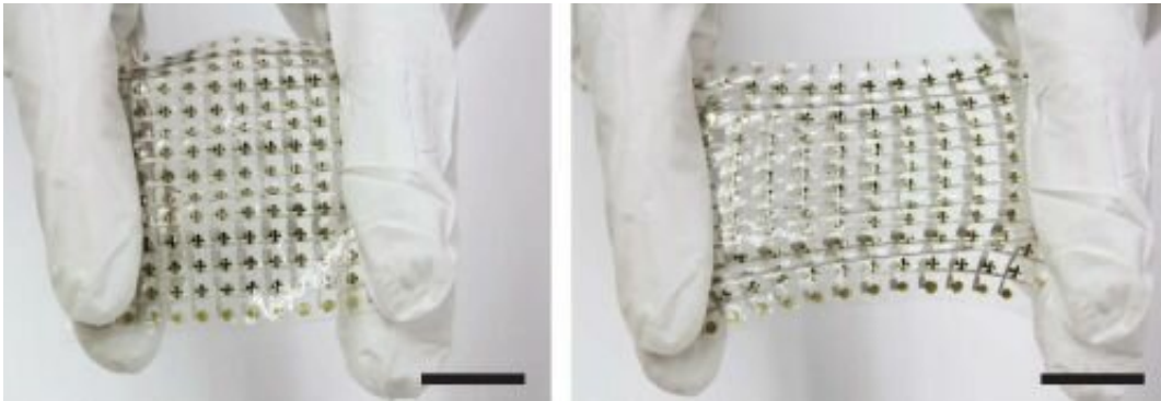
Image 2: This solar cell can be stretched (L) or twisted (R) without performance degradation.

An alternative to batteries is stretchable nanogenerators, which can produce electricity from various freely available vibrations, such as wind or human body movements. Stretchable solar cells could also be used to power wearable electronic devices.