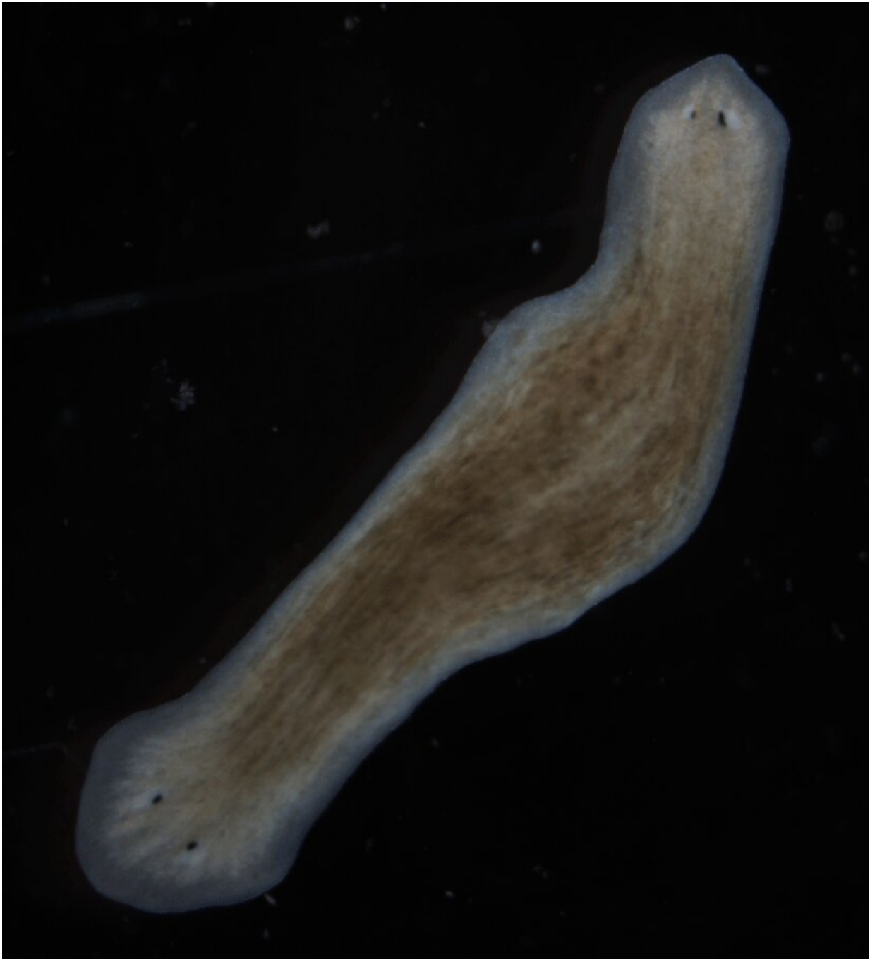
A planarian flatworm with two heads.

Unlike most multicellular animals, planarian flatworms can regrow all