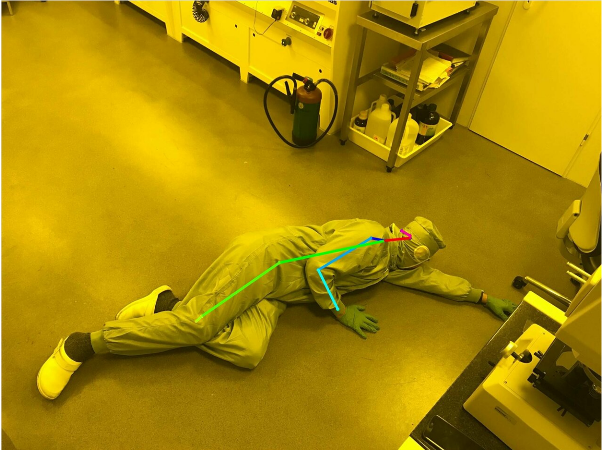
Realtime Pose Estimation.

Another important component of our system is what we call Smart Data Exchange. It guarantees a maximum of data security and data integrity, e.g. if data must be transferred from one production site to another.