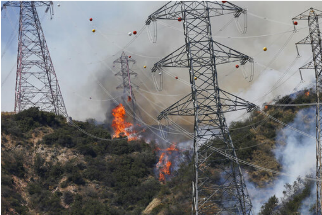
In this Monday, June 20, 2016 file photo, fires burn on a hillside near power lines outside Azusa, Calif., as wildfires erupted in Southern California during an intensifying heat wave stretching from the West Coast to New Mexico.