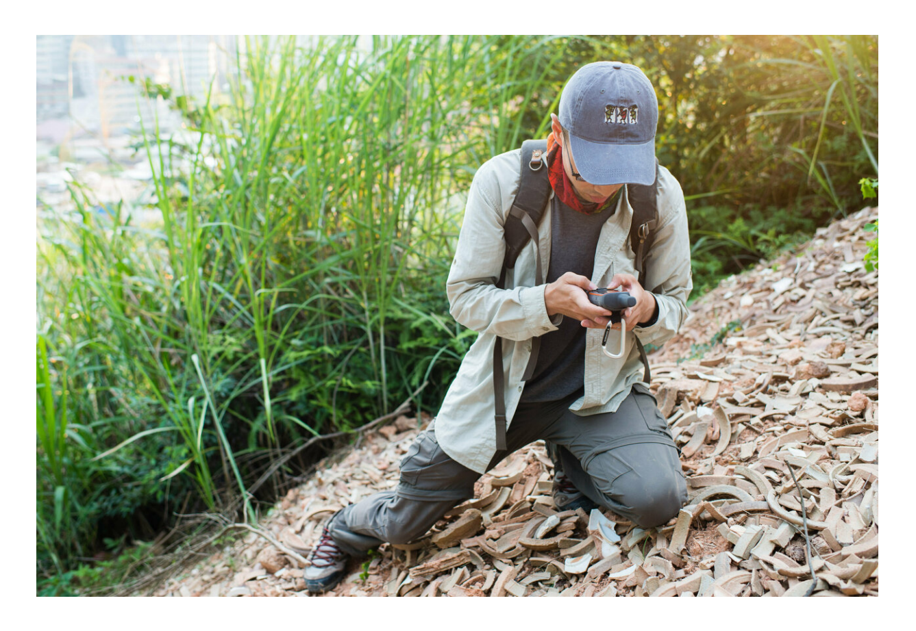
Recording the location of the Shimuling kiln site, Dehua.

Ceramics from different sites have different chemical compositions because of variations in the elements present in that region's clay or in the recipes that potters used to mix their clay. If a piece of pottery from the shipwreck matches the pottery found at an archaeological site, it's a pretty safe bet that the pottery originated there. "Each kiln site uses its own materials and ingredients for clay—that's what makes each sample's fingerprint unique," explains Xu. "If the fingerprint of the sample matches the fingerprint of the kiln site, then it's highly possible that that's where the sample came from." This is where the X-ray gun comes in.