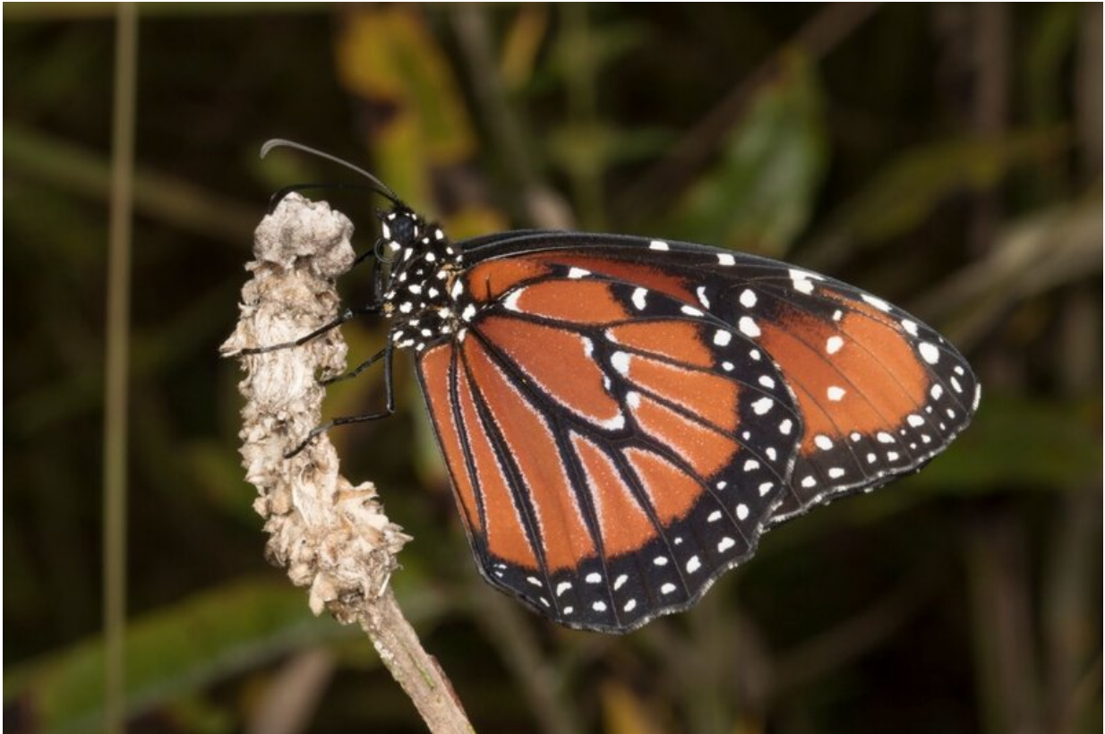
The unpalatable queen butterfly, Danaus glippus.