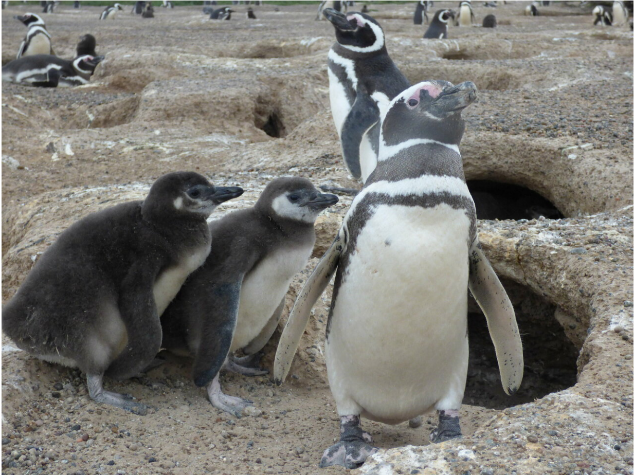
Magellanic adult with two chicks at Punta Tombo in December 2016.

As expected, chicks without a sibling received more food during a feeding and were heavier than chicks with a sibling. Before eating, singleton chicks weighed an average of about 5.7 pounds and received about 1.2 pounds of food on average per feeding. For two-chick nests, the heavier and lighter chicks weighed an average of 5.1 pounds and 4.2 pounds, respectively. Yet both chicks received about 0.8 pounds of food on average per feeding.