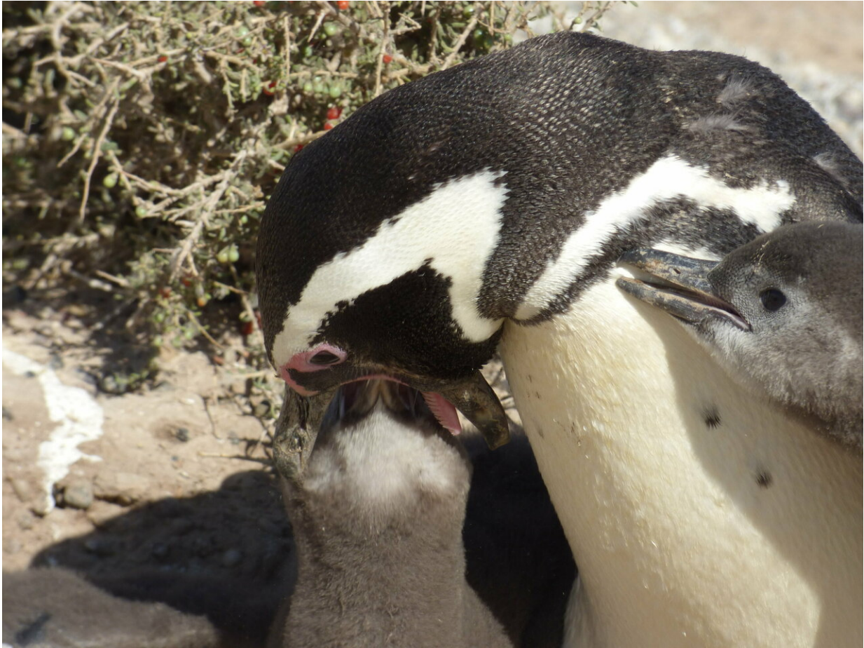
Magellanic parent feeding its chicks at Punta Tombo in January 2016.

Magellanic chicks are the same size when they hatch, but eggs within a nest hatch at different times. After mating, a Magellanic female lays two eggs about four days apart. One chick typically hatches at least two days before the other. Chicks grow to different sizes based on the timing of their first feedings. By the time both chicks are at least 20 days old, one chick is on average 22 percent heavier than its sibling, the team found. Yet despite these size differences, this study shows that when Magellanic chicks are older and more mobile, parents feed both chicks equally as well as rapidly.