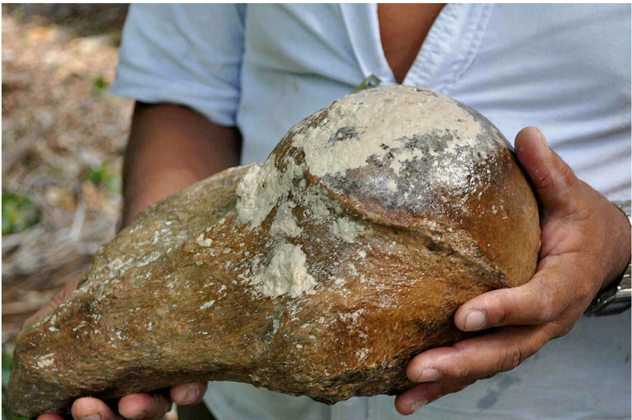
Part of an extinct giant sloth's upper humerus recovered by divers during the 2014 excavations.