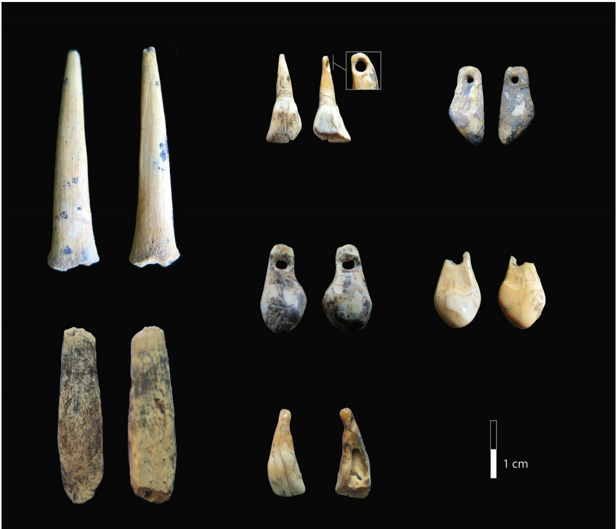
Bone points and pierced teeth from the early Upper Palaeolithic layers of Denisova Cave sampled for radiocarbon dating.