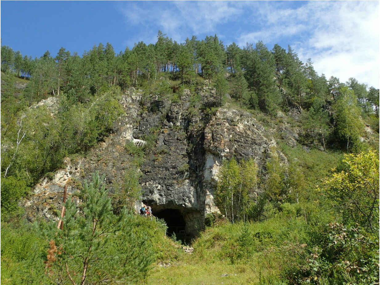
Entrance to Denisova Cave.

Most of the evidence for Neanderthals at Denisova Cave falls within the last interglacial period around 120,000 years ago, when the climate was relatively warm, whereas Denisovans survived through much colder periods, too, before disappearing around 50,000 years ago.