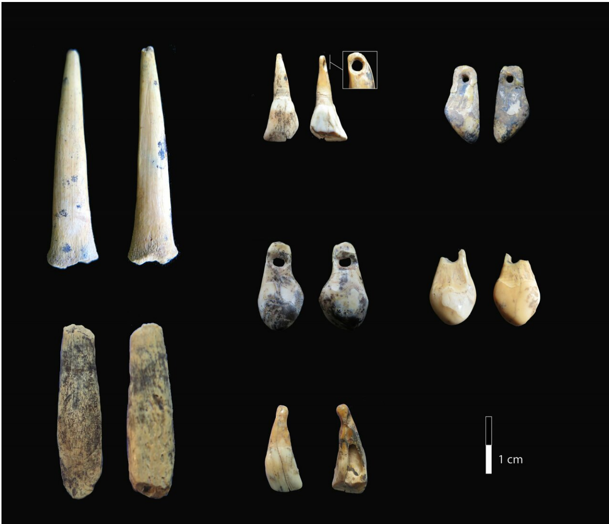
Bone points and pierced teeth from the early Upper Palaeolithic layers of Denisova Cave sampled for radiocarbon dating.