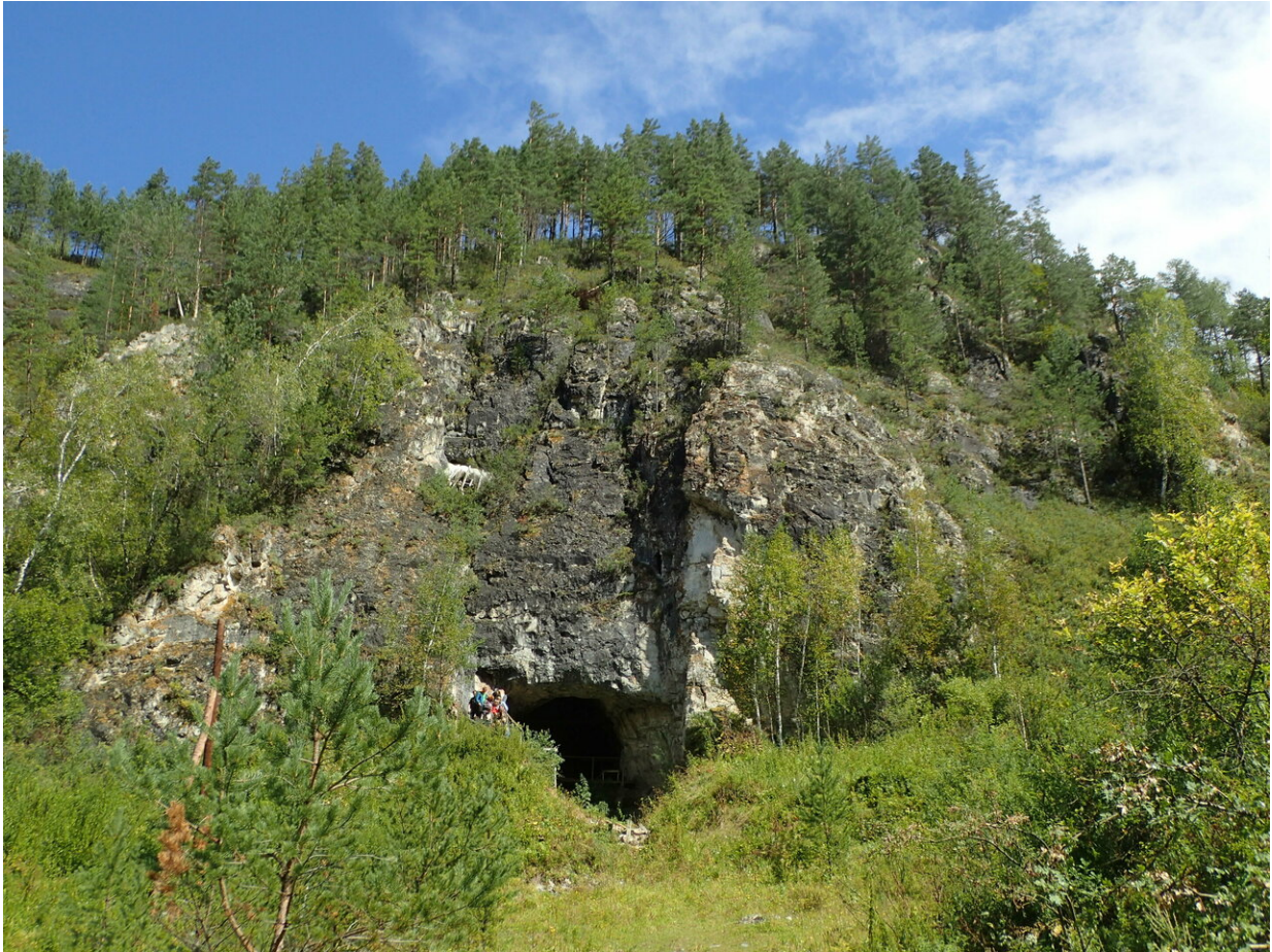
Entrance to Denisova Cave.

Most of the evidence for Neanderthals at Denisova Cave falls within the last interglacial period around 120,000 years ago, when the climate was relatively warm, whereas Denisovans survived through much colder periods, too, before disappearing around 50,000 years ago.