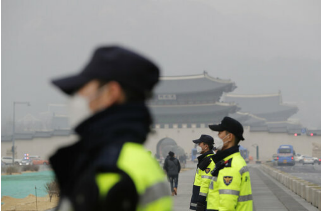
Police officers wearing a mask stand guard in heavy smog in Seoul, South Korea, Monday, Jan. 14, 2019. Unusually high levels of smog worsened by weather patterns are raising alarm across Asia.