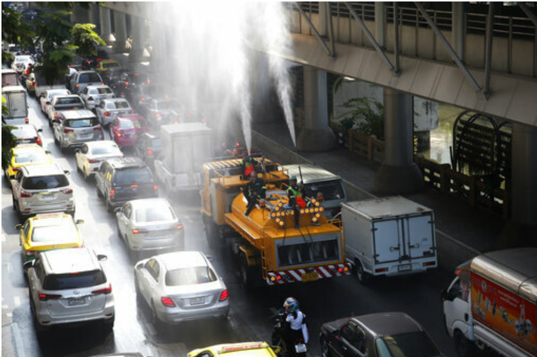
Bangkok road crews spray water in hopes to control heavy smog in Bangkok, Thailand, Monday, Jan. 14, 2019. Unusually high levels of smog worsened by weather patterns are raising alarm across Asia.