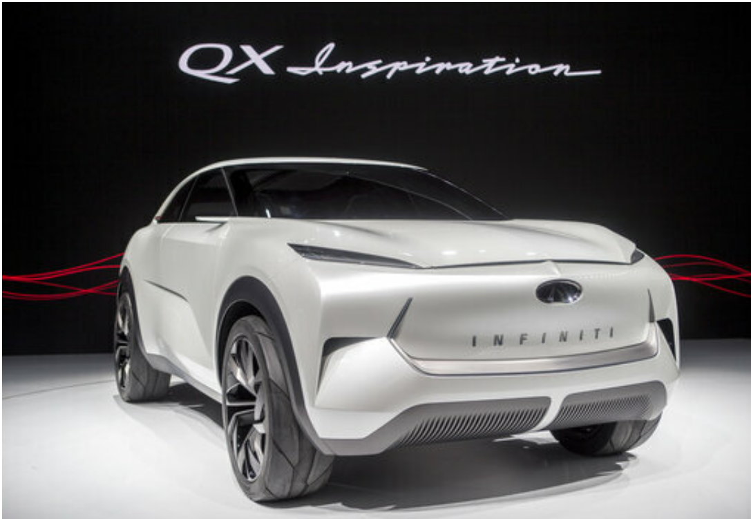
The Infiniti QX Inspiration concept vehicle is presented at the North American International Auto Show, Monday, Jan. 14, 2019, in Detroit, Mich.