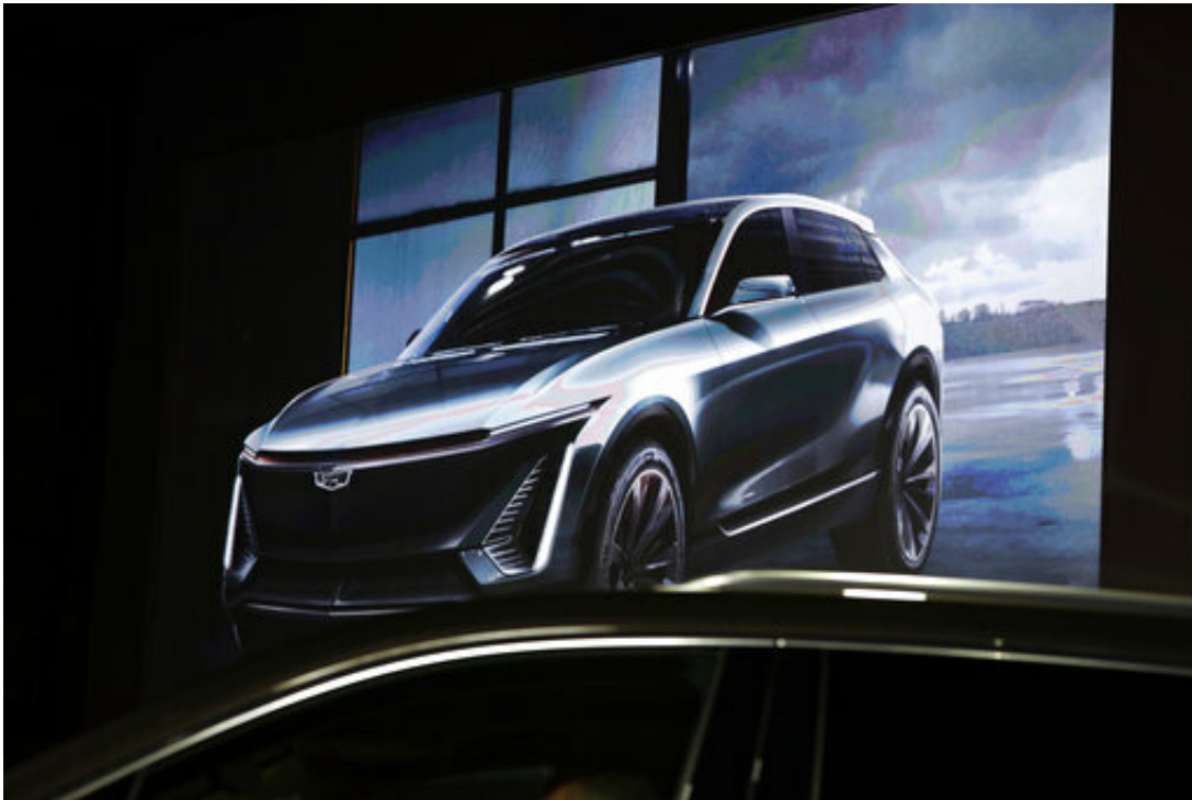
A future Cadillac electric crossover SUV concept is shown on video during media previews for the North American International Auto Show in Detroit, Sunday, Jan. 13, 2019.