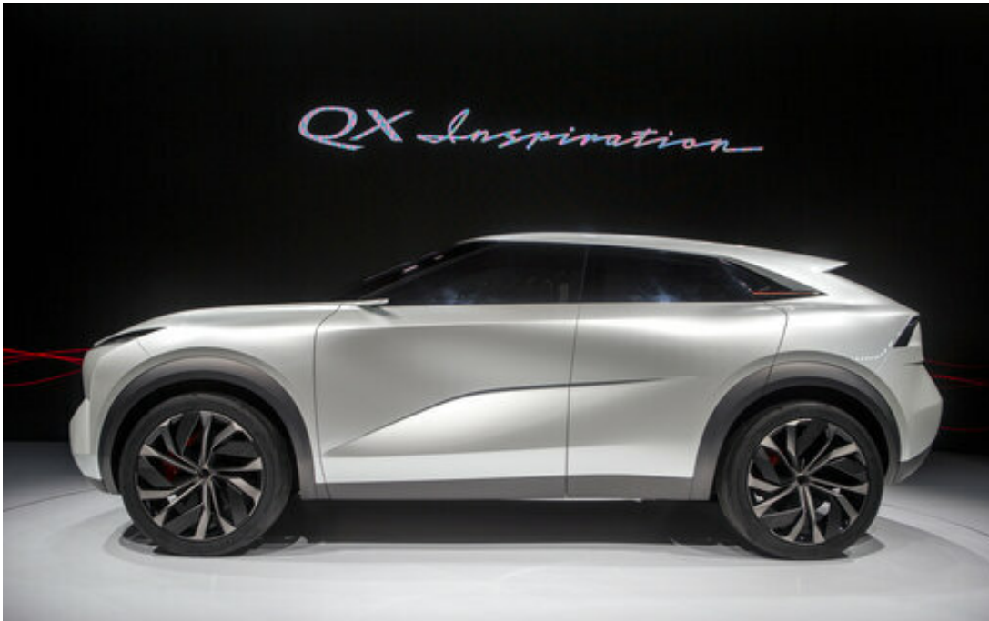
The Infiniti QX Inspiration concept vehicle is presented at the North American International Auto Show, Monday, Jan. 14, 2019, in Detroit, Mich.