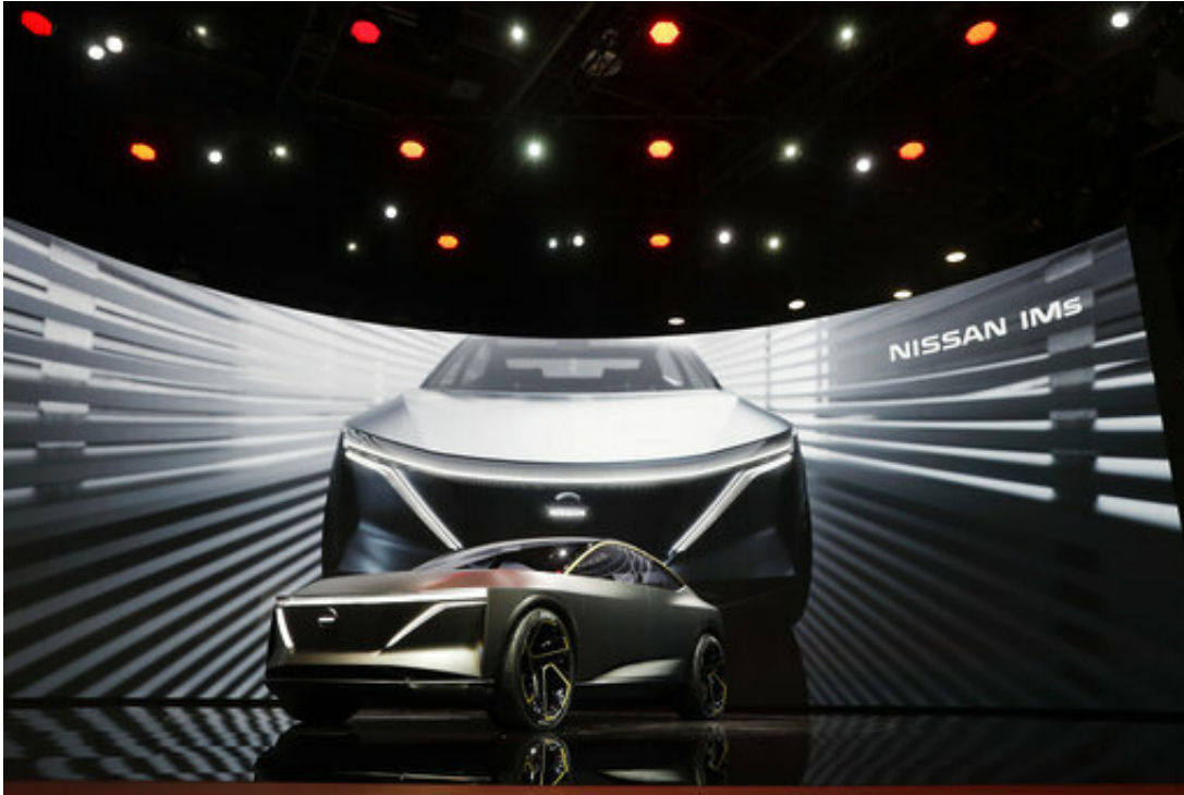
The Nissan IMS concept debuts during media previews for the North American International Auto Show in Detroit, Monday, Jan. 14, 2019.