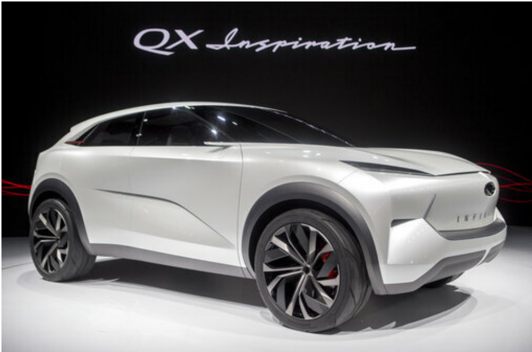
The Infiniti QX Inspiration concept vehicle is presented at the North American International Auto Show, Monday, Jan. 14, 2019, in Detroit, Mich.