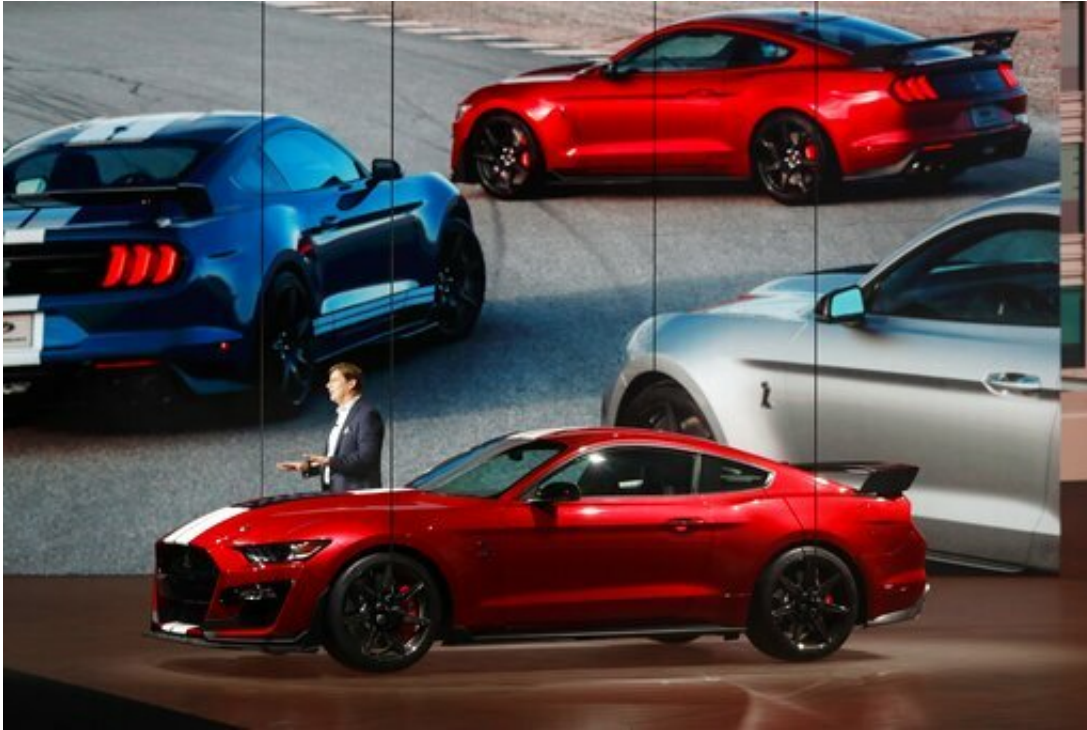
Ford Motor Company's Executive Vice President and president, Global Markets, Jim Farley introduces the 2020 Ford Mustang Shelby GT500, Monday, Jan. 14, 2019, at the North American International Auto Show in Detroit.