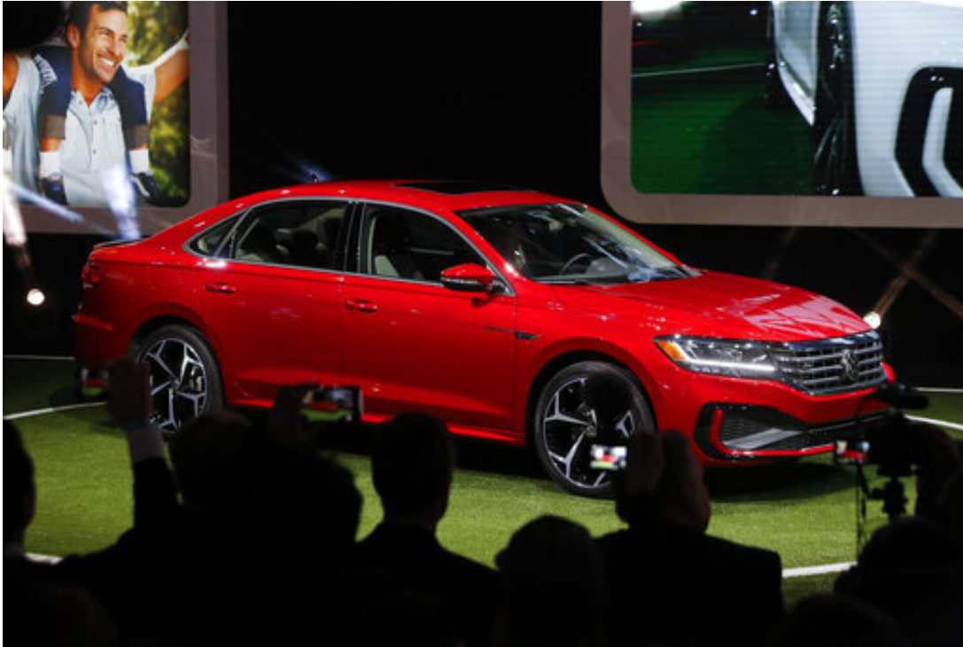
The 2020 Volkswagen Passat debuts during media previews for the North American International Auto Show in Detroit, Monday, Jan. 14, 2019.