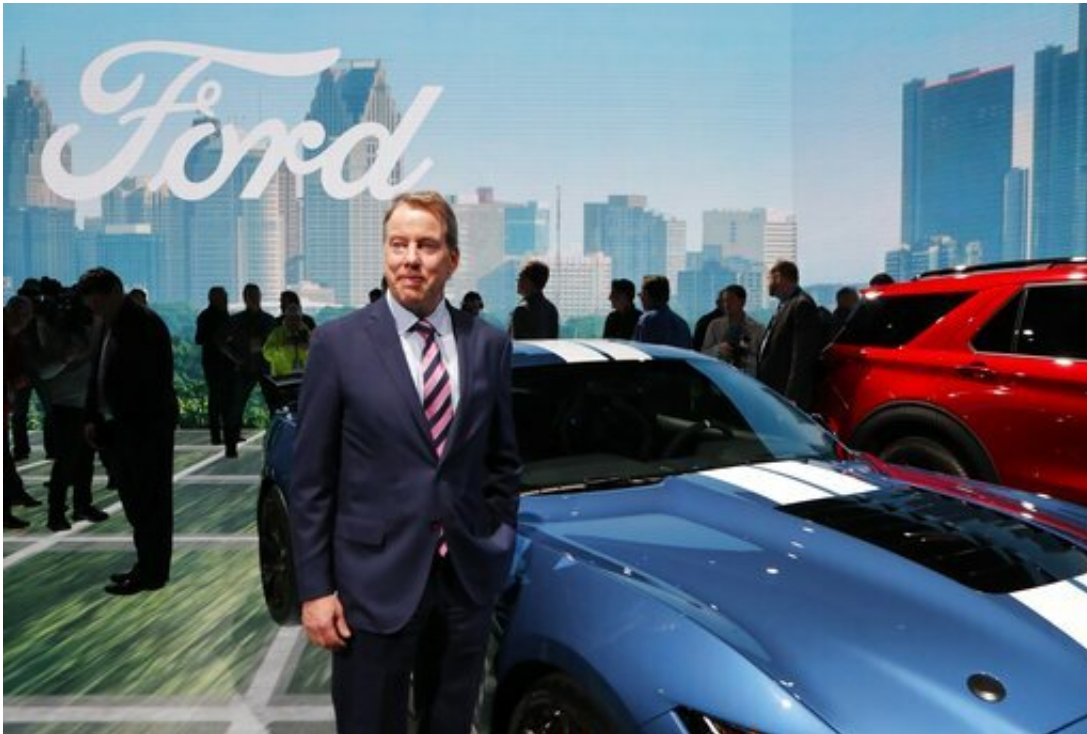
Ford Motor Co. Executive Chairman Bill Ford stands next to the 2020 Ford Mustang Shelby GT500, Monday, Jan. 14, 2019, at the North American International Auto Show in Detroit.