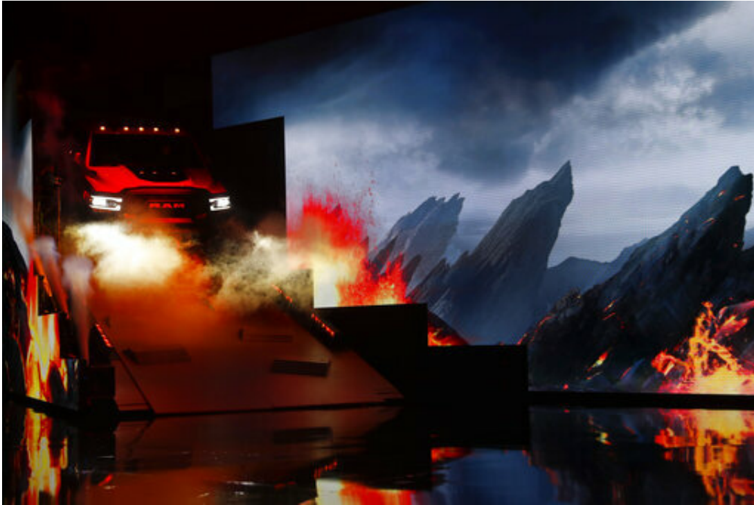
The Ram 2500 Power Wagon is debuts during media previews for the North American International Auto Show in Detroit, Monday, Jan. 14, 2019.