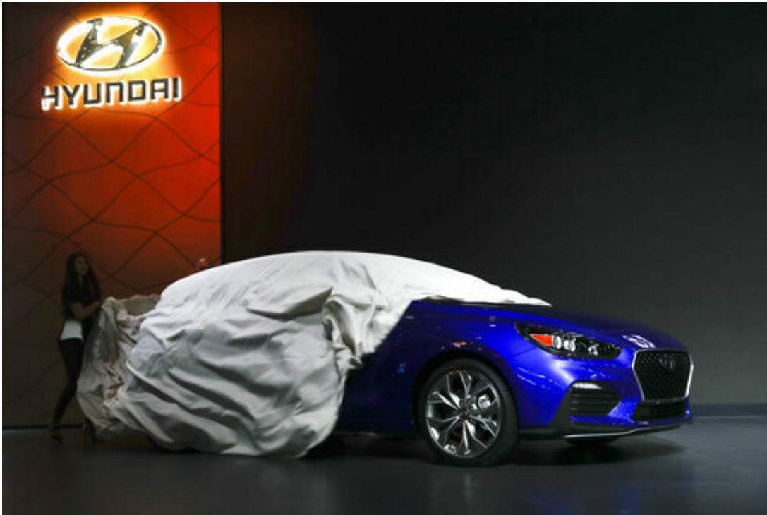
The Hyundai Elantra GT N Line debuts during media previews for the North American International Auto Show in Detroit, Monday, Jan. 14, 2019.