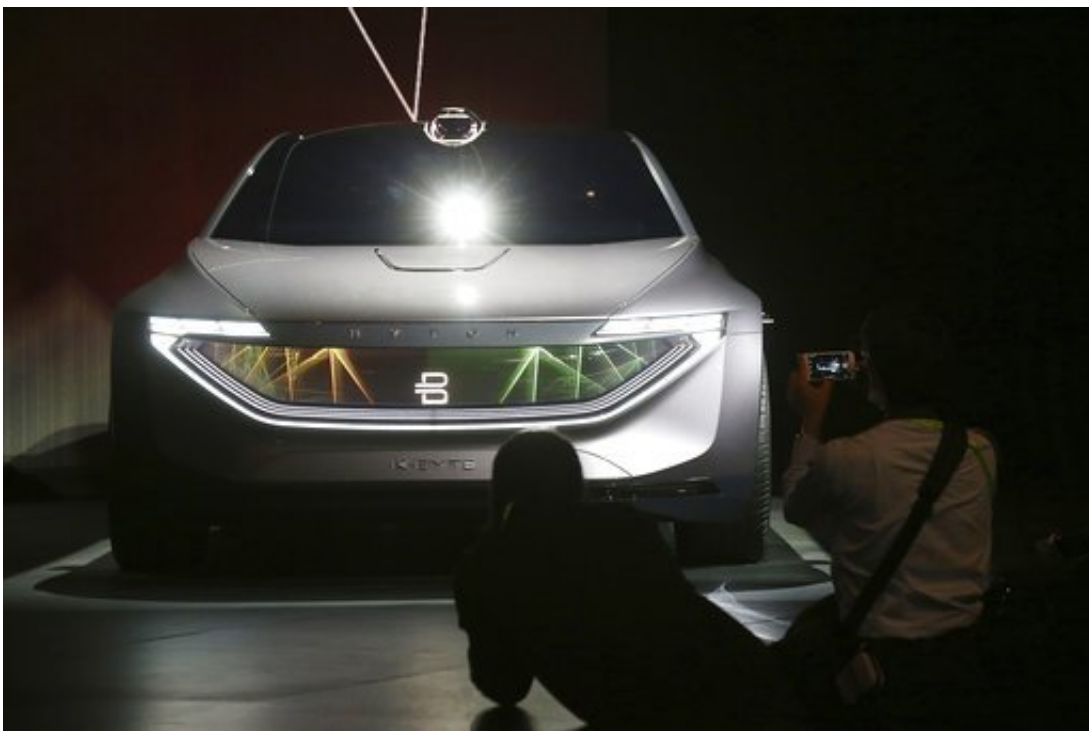
Byton unveils the K-Byte Concept car during a news conference before CES International Sunday, Jan. 6, 2019, in Las Vegas.

Samsung announced Sunday that its TVs will start offering Apple's iTunes movies and TV shows beginning this spring. It's a shift for Apple, which typically hasn't allowed its services to run on non-Apple hardware. (The big exception: iTunes on Windows PCs.)