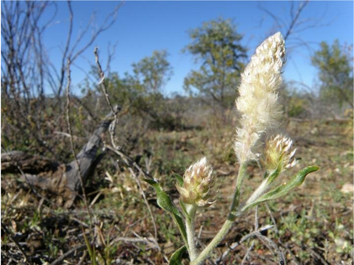
Ptilotus brachyanthus.