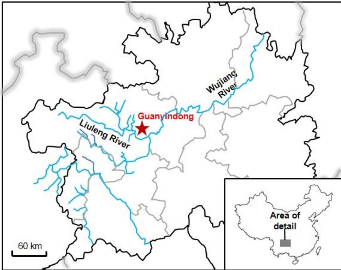
Map showing the location of the Guanyindong Cave site in China.

"Our work reveals the complexity and adaptability of people there that is equivalent to elsewhere in the world. It shows the diversity of the human experience.