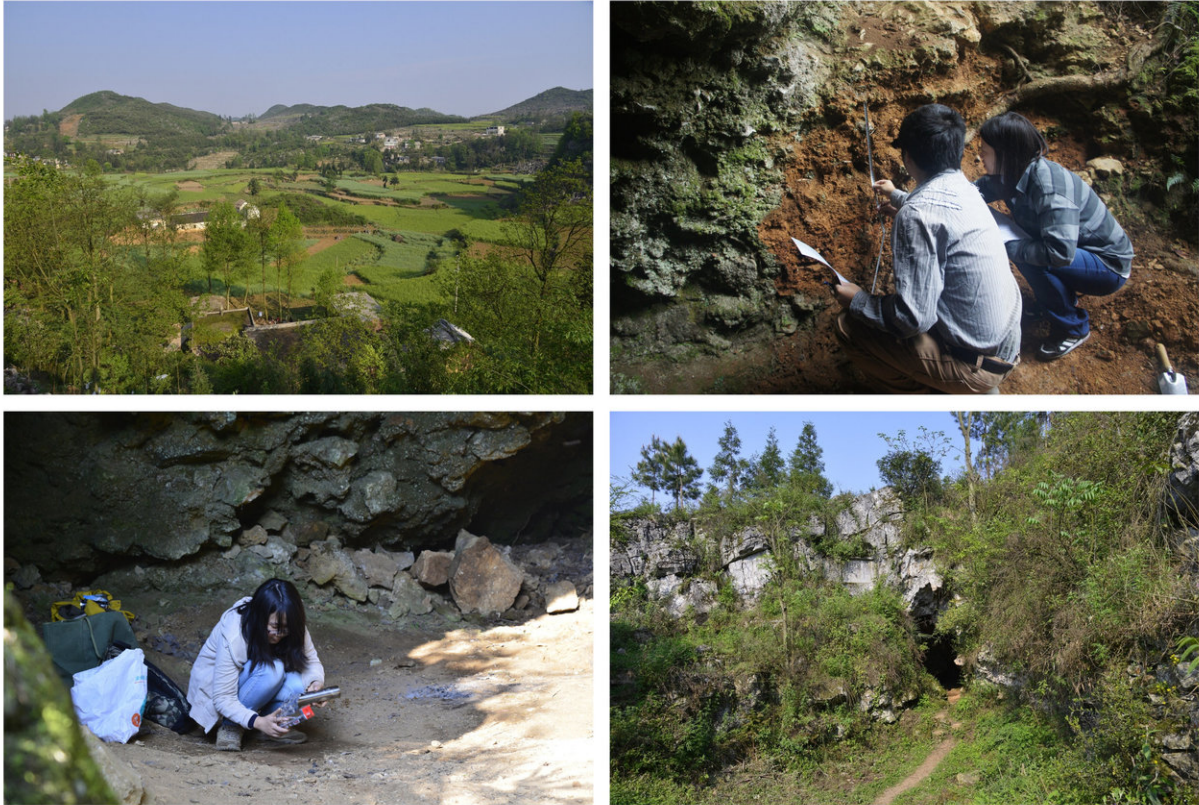
The Guanyindong Cave site in southwest China.

What they found was that the deepest layers of the cave in which Levallois tools were uncovered dated back to about 170,000 years ago, while those from the upper layers dated to approximately 80,000 years ago.