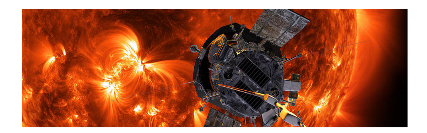
Illustration of Parker Solar Probe approaching the Sun.

Parker Solar Probe is alive and well after skimming by the sun at just 15 million miles from our star's surface. This is far closer than any spacecraft has ever gone—the previous record was set by Helios B in 1976 and broken by Parker on Oct. 29—and this maneuver has exposed the spacecraft to intense heat and solar radiation in a complex solar wind environment.