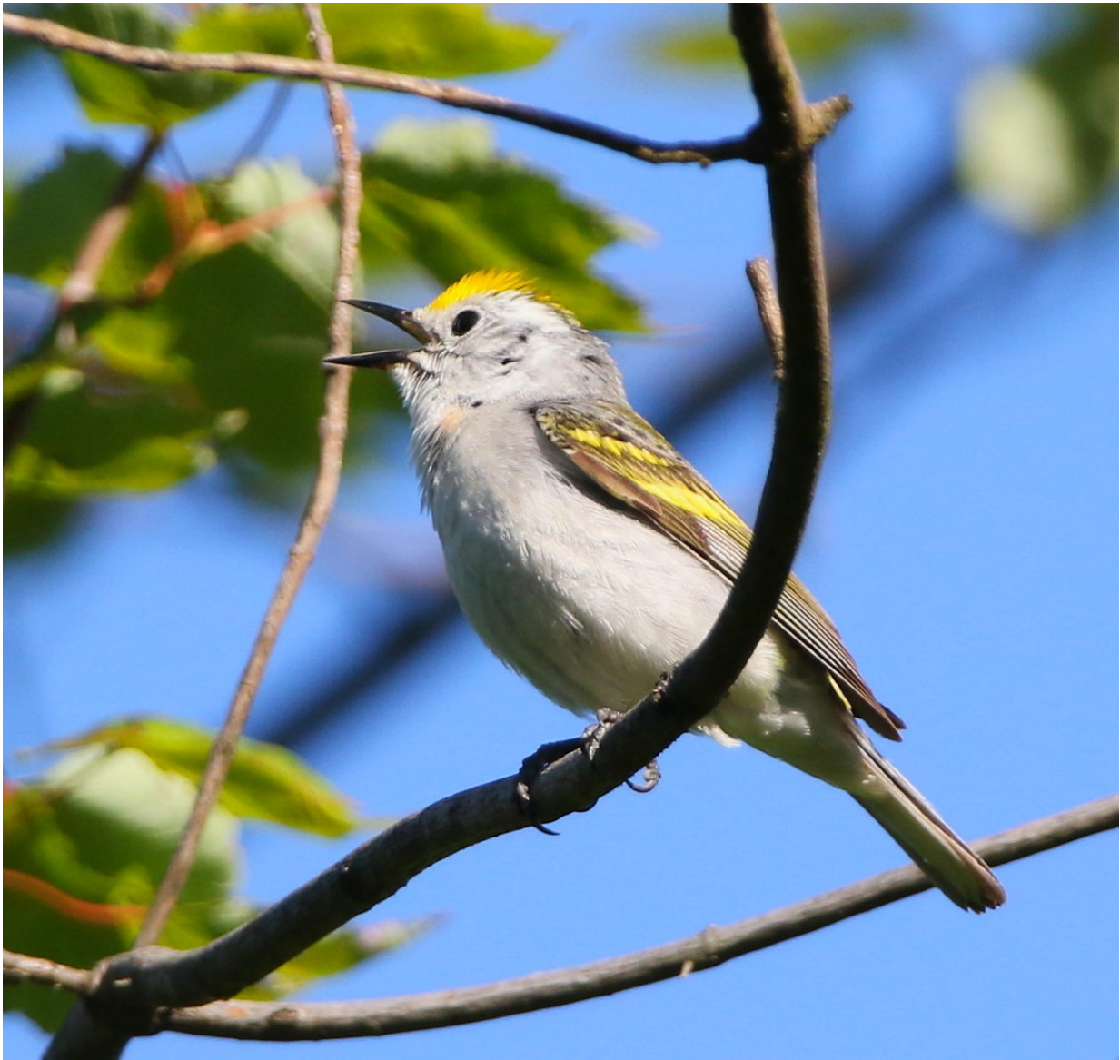
Rare triple-hybrid warbler (Golden-winged Warbler, Blue-winged Warbler, and Chestnut-sided Warbler).

The key to identifying the triple-hybrid's parents came from genetic analyses.