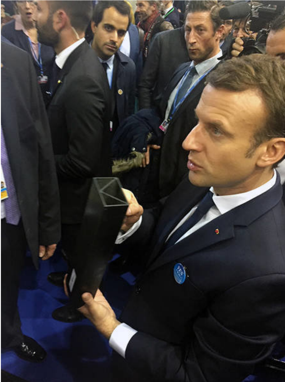
French President Emmanuel Macron at the UN Climate Change Conference 2017 in Bonn with the sample of a carbon fiber reinforced granite carrier.