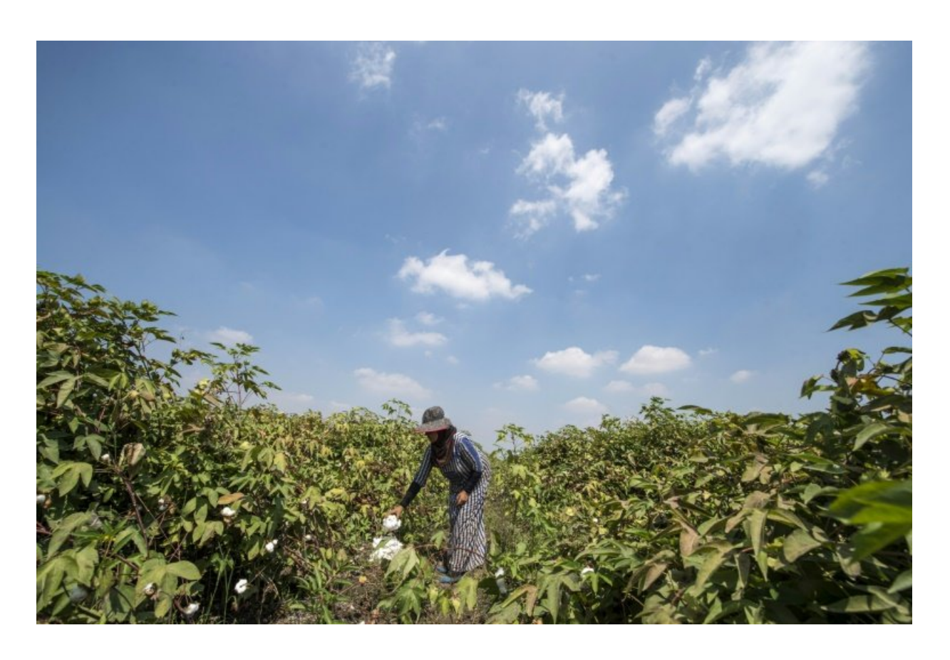
An Egyptian cotton picker at work in Kafr el-Sheikh in the Nile Delta

Back in 1975, Egypt exported $540 million of cotton. By 2016, the sector's export receipts had fallen to $90.4 million, according to the Massachusetts Institute of Technology.