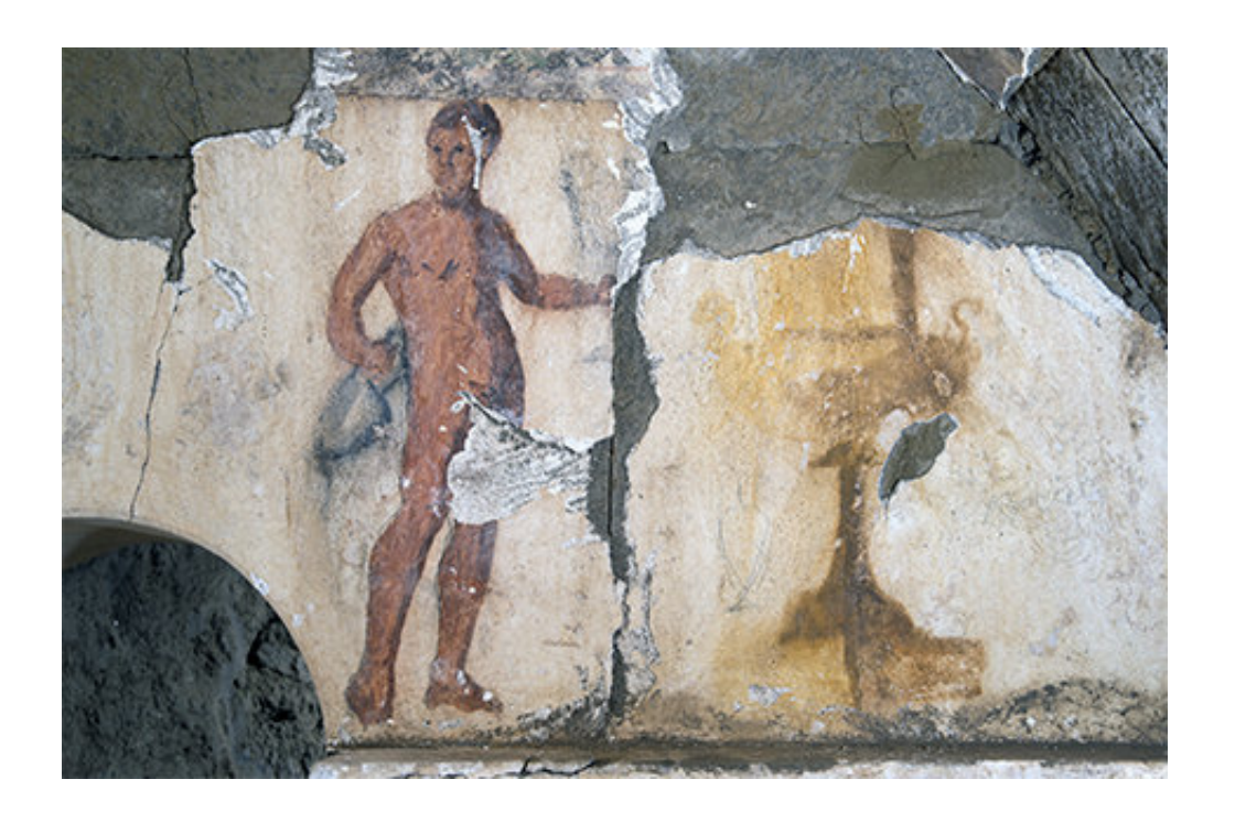
Preserved paintings on the right side of the entrance wall (detail).

Until now, only tombs painted red or white had been found, but in June 2018 researchers discovered a room with exceptionally executed figure painting. A naked servant carrying a jug of wine and a vase is still visible; the banquet's guests are thought to have been painted on the side walls. Other elements of the banquet can also be distinguished. In addition to the excellent state of conservation of the remaining plaster and pigments, such a décor in a tomb built in that period is rare; its "unfashionable" subject matter was in vogue one or two centuries earlier. This discovery is also an opportunity to trace artistic activity over time at the site.