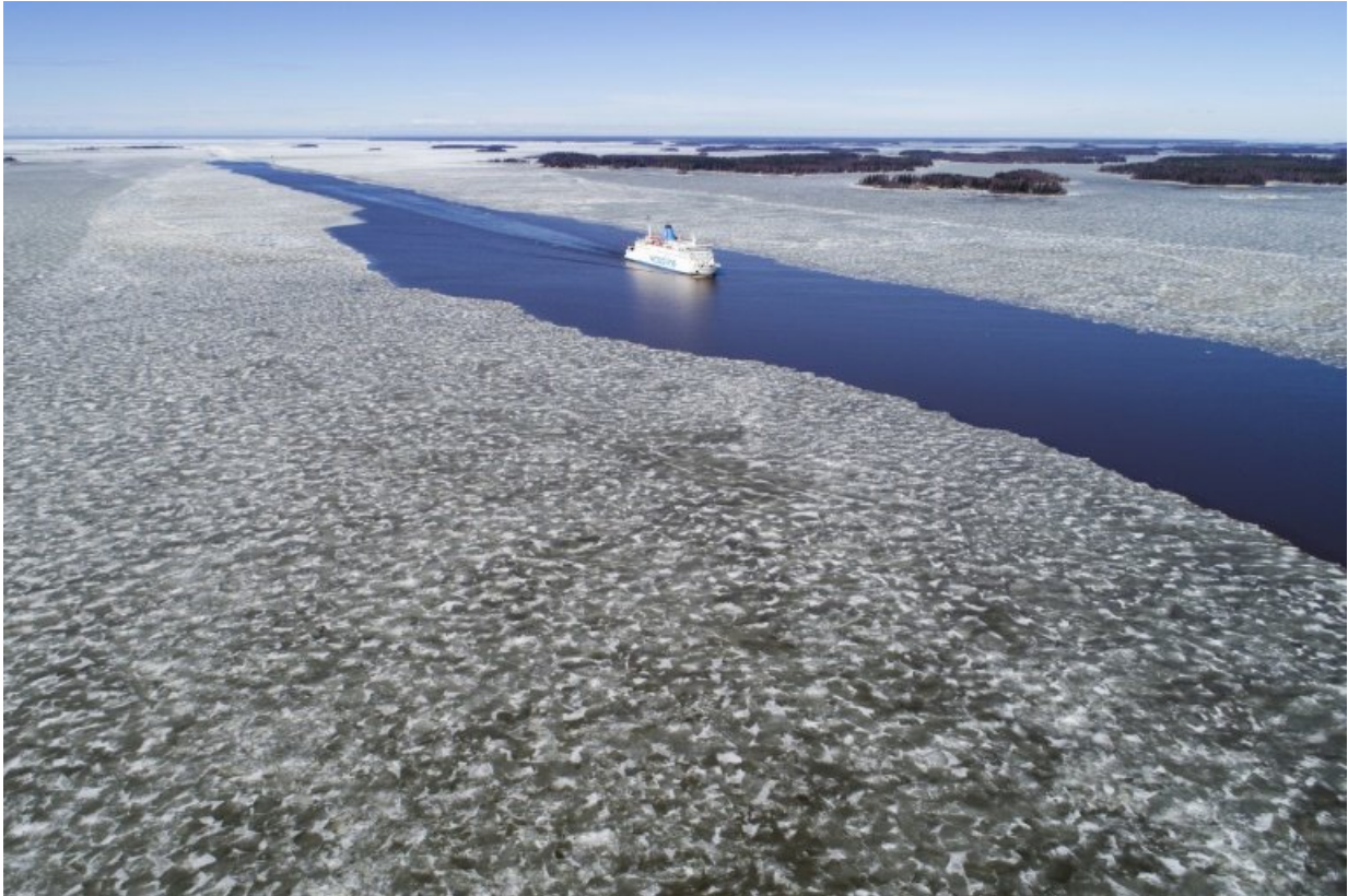
A ferry sails through the melting ice near Vaasa in western Finland

For many scientists, these targets are technically feasible but politically or socially unrealistic, along with the broader 1.5C goal.