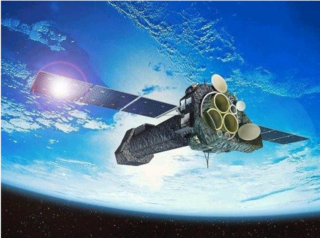
The XMM-Newton spacecraft.

Until now it has been unclear how misaligned rotation might affect the in-fall of gas. This is particularly relevant to the feeding of supermassive black holes since matter ( interstellar gas clouds or even isolated stars) can fall in from any direction.