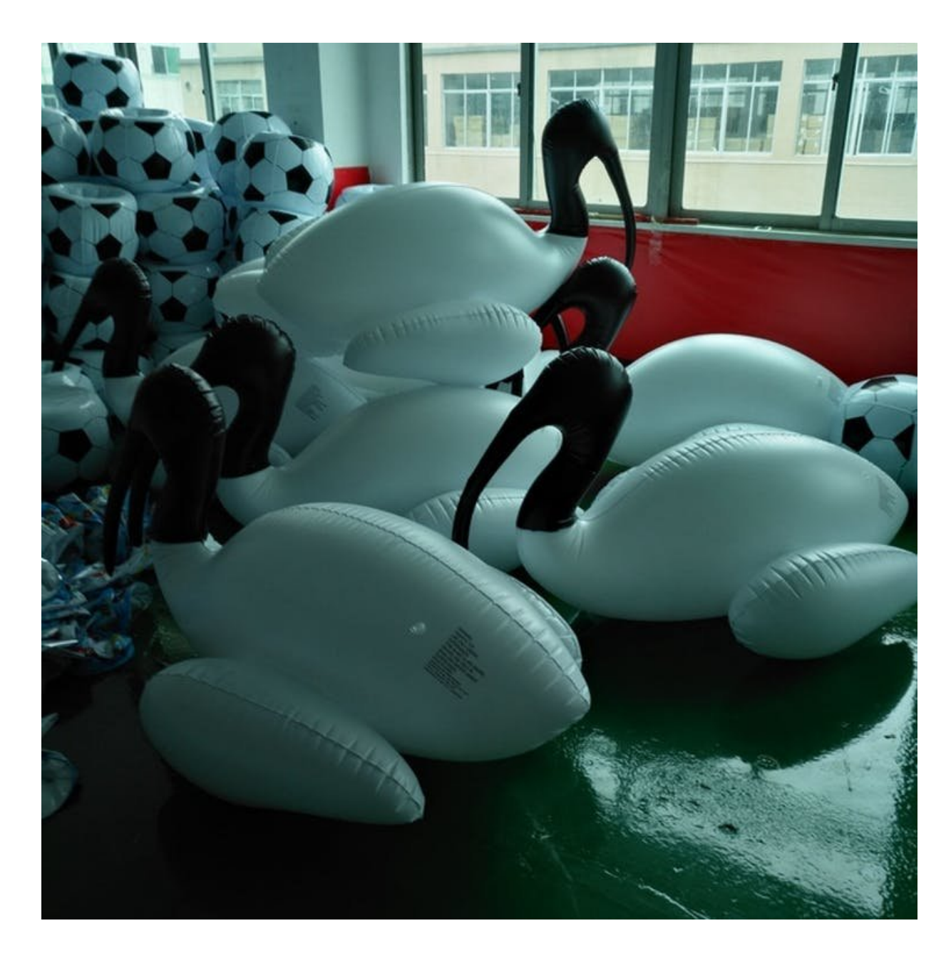
Inflatable ibis. Credit: Casey/Big Bird Designs, Queensland

<u>Ibis also migrated</u> from interior wetlands to the coasts of east and southeast Australia and the southwest. That migration was forced by drought and habitat loss, which have caused <u>huge declines</u> in inland ibis numbers. Sydney's ibis population today is estimated at about <u>10,000</u>.