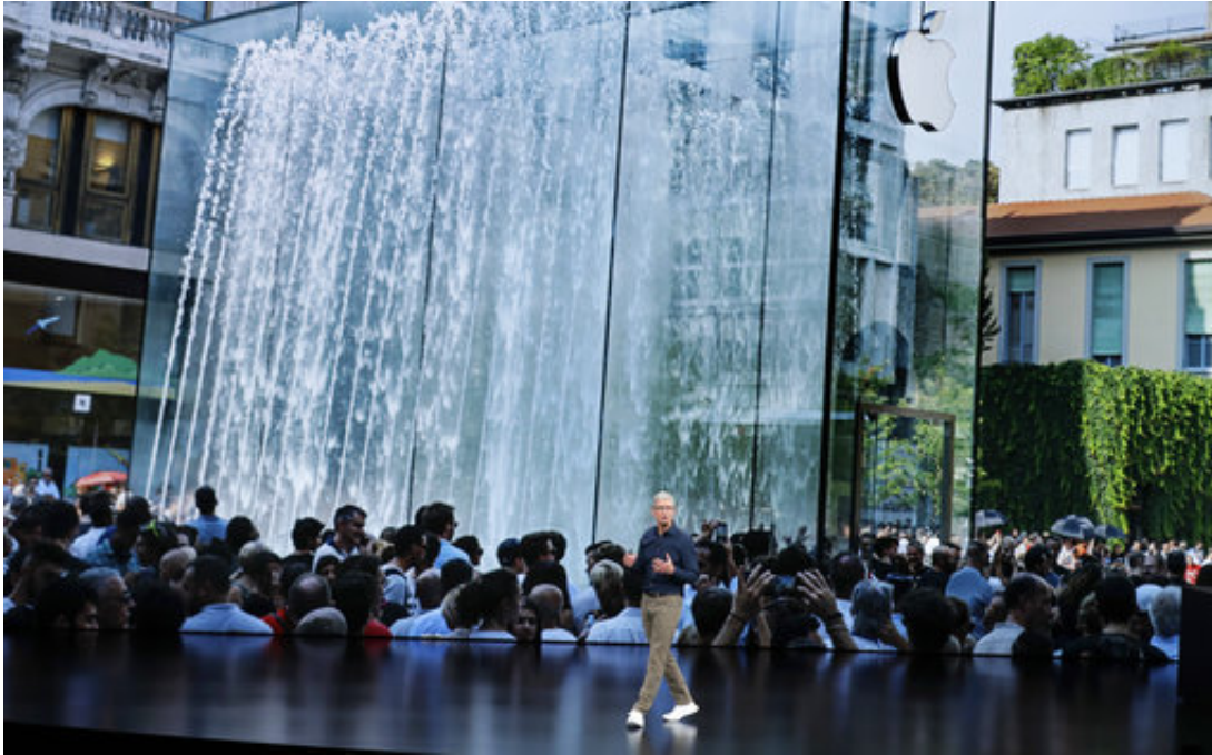
Apple CEO Tim Cook speaks at the Steve Jobs Theater during an event to announce new Apple products Wednesday, Sept. 12, 2018, in Cupertino, Calif.