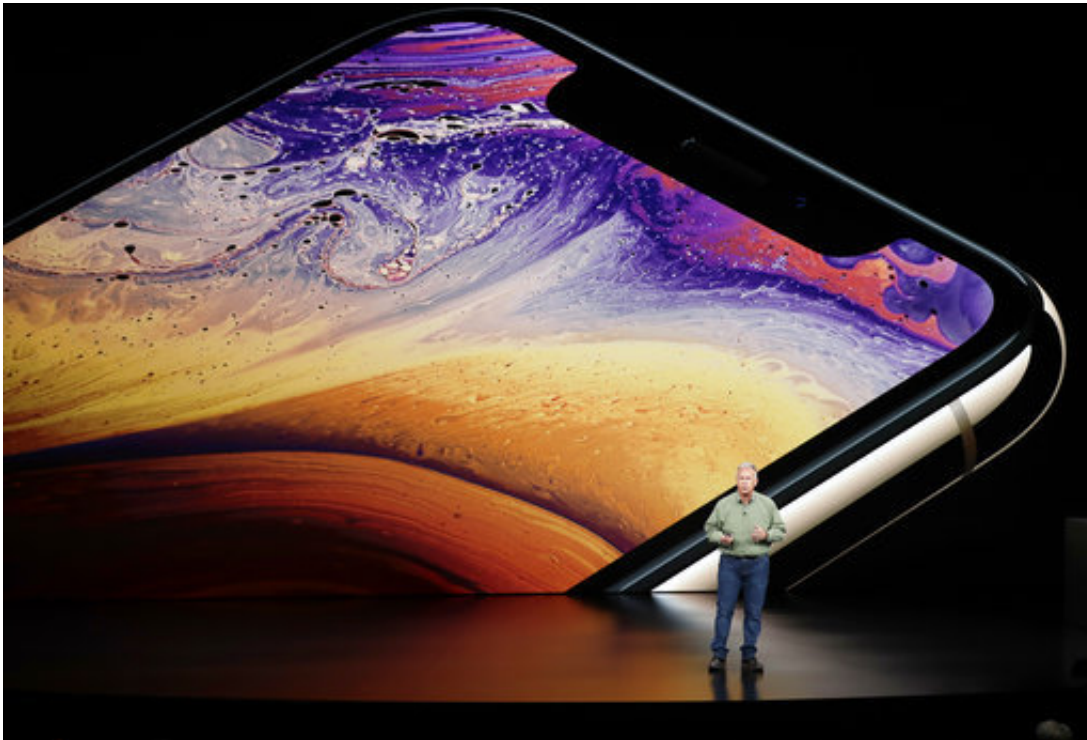
Phil Schiller, Apple's senior vice president of worldwide marketing, speaks about the Apple iPhone XS at the Steve Jobs Theater during an event to announce new Apple products Wednesday, Sept. 12, 2018, in Cupertino, Calif.