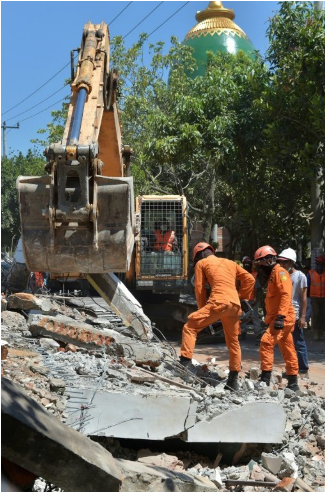
Tens of thousands of homes, businesses and mosques were levelled by the quake,